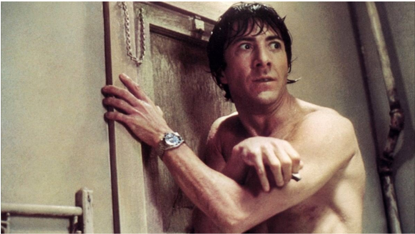
All the President's Men