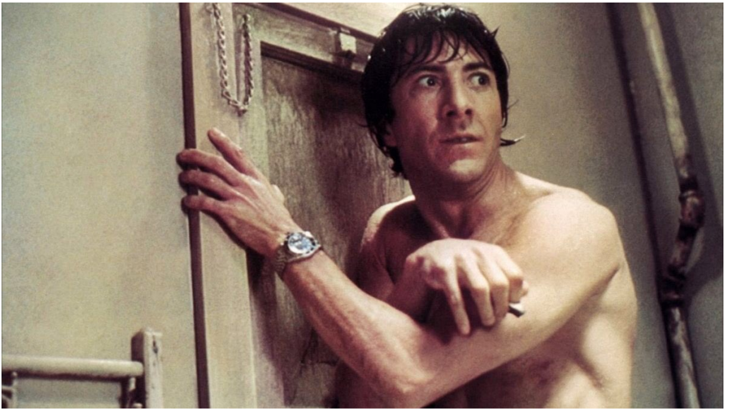
All the President's Men