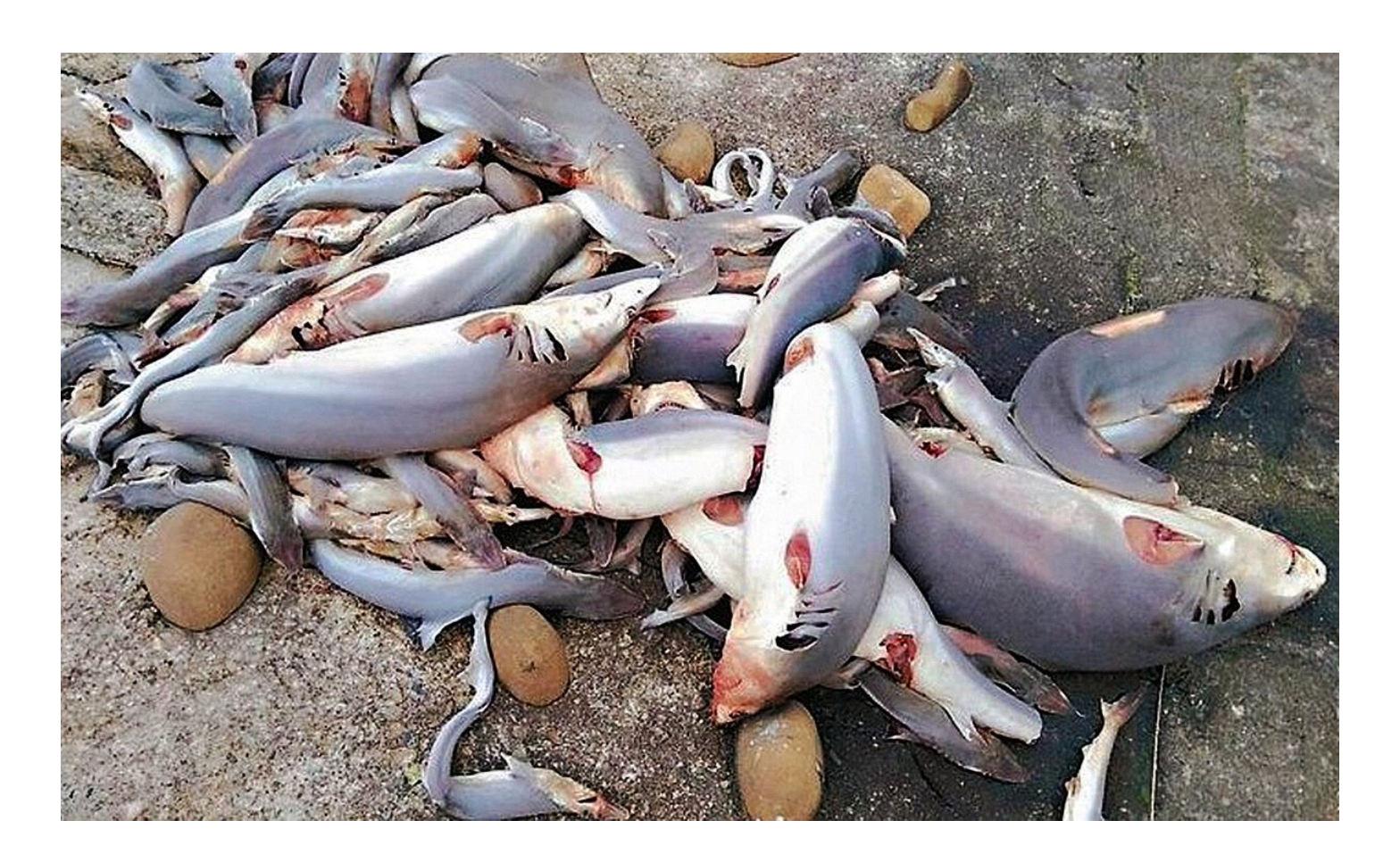
What can we do?