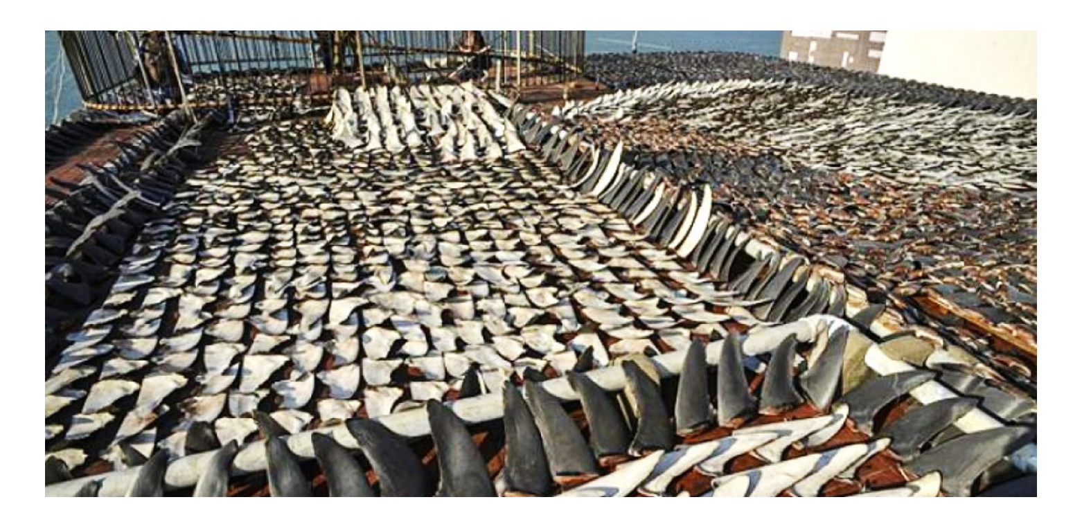
Because of one stupid film sharks are one of most feared animals on the planet, but by the time you scroll down this thread, 73 more sharks would have been killed.

Approximately 100 million sharks are killed globally each year & one of the major incentives for this is the shark fin trade.