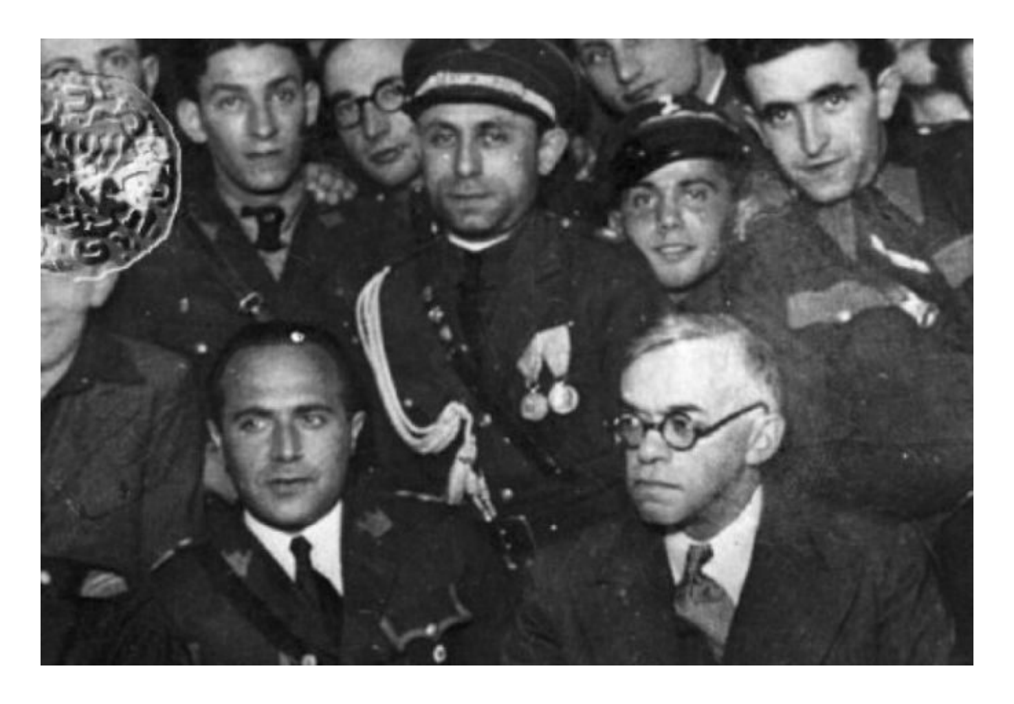
"A secret jewish military organization calling itself 'Irgun' assumed responsibility for the bombings and murders and stated that it would continue its activities until Palestine was opened to unlimited immigration." - JTA 1944 <a href="https://t.co/4gTjFCHoft">https://t.co/4gTjFCHoft</a>

The #Mussolini-#Jabotinsky Connection: The Hidden Roots of #Israel Fascist Past Matteo Salvini, has vowed that if he becomes #Italy's next Prime Minister, he will recognize #Jerusalem as the capital of Israel.#CampBetar <a href="https://t.co/6fWjR9KWTI">https://t.co/6fWjR9KWTI</a>