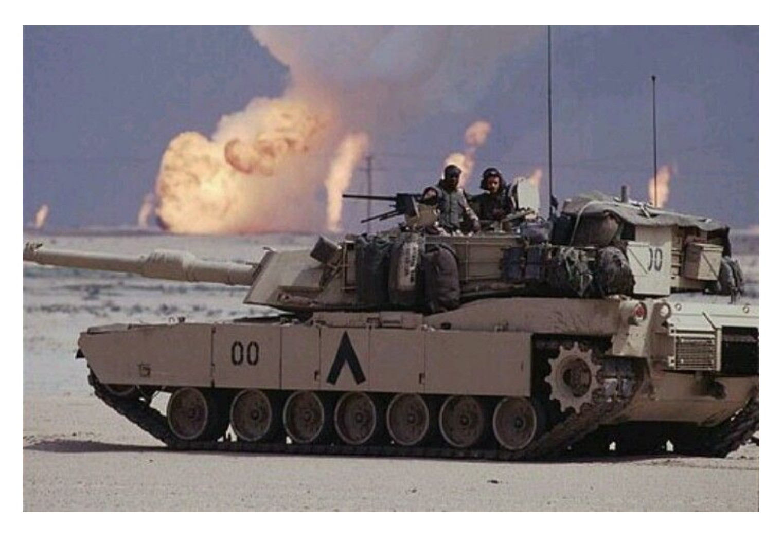
By February 27, these forces had destroyed most of Iraq's elite Republican Guard units after the latter had tried to make a stand south of Al-Ba rah in southeastern Iraq.