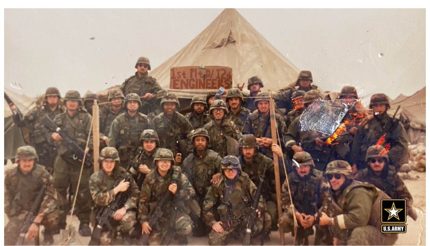
The #PersianGulfWar (1990–91), was an international conflict that was triggered by Iraq's invasion of Kuwait on August 2, 1990.

Saddam Hussein, ordered the invasion and occupation of Kuwait with the apparent aim of acquiring that nation's large oil reserves.