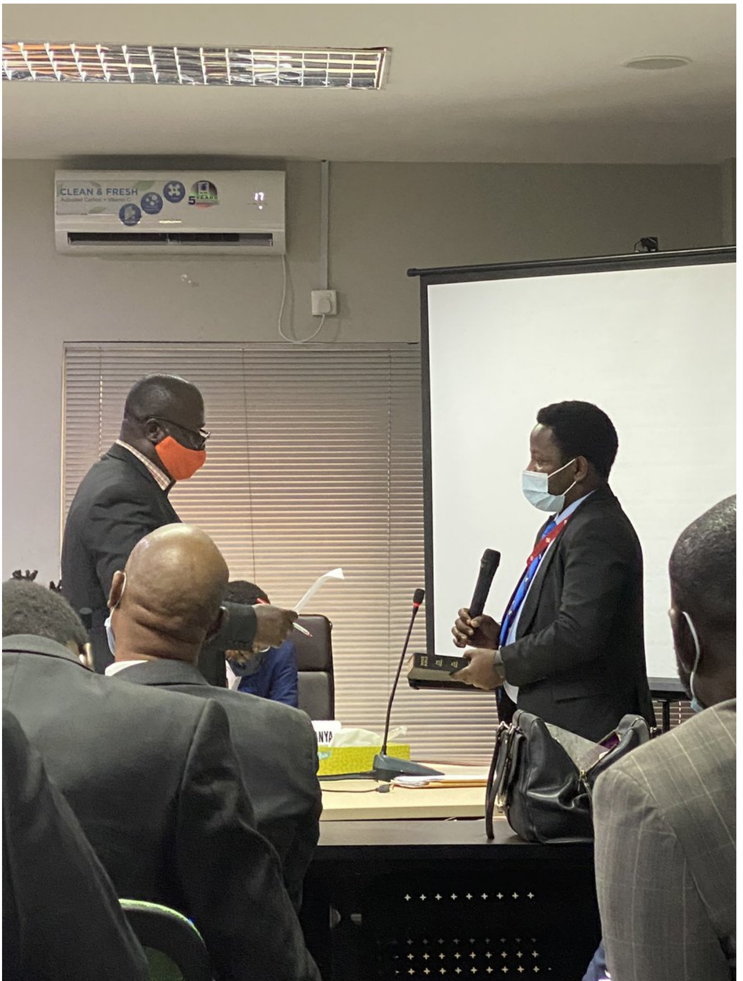
Two consultants who work at Redington and also treated some of these patients are present. Unfortunately they can't take the witness stand, the hospital documents are submitted as exhibits and this case is adjourned to Jan 30, 2021. #ENDSARS