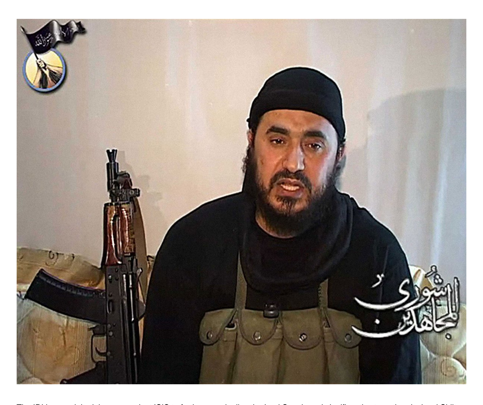
The IRI has exploited the war against ISIS to further marginalize the Iraqi Sunnis and significantly strengthen its loyal Shiite array.