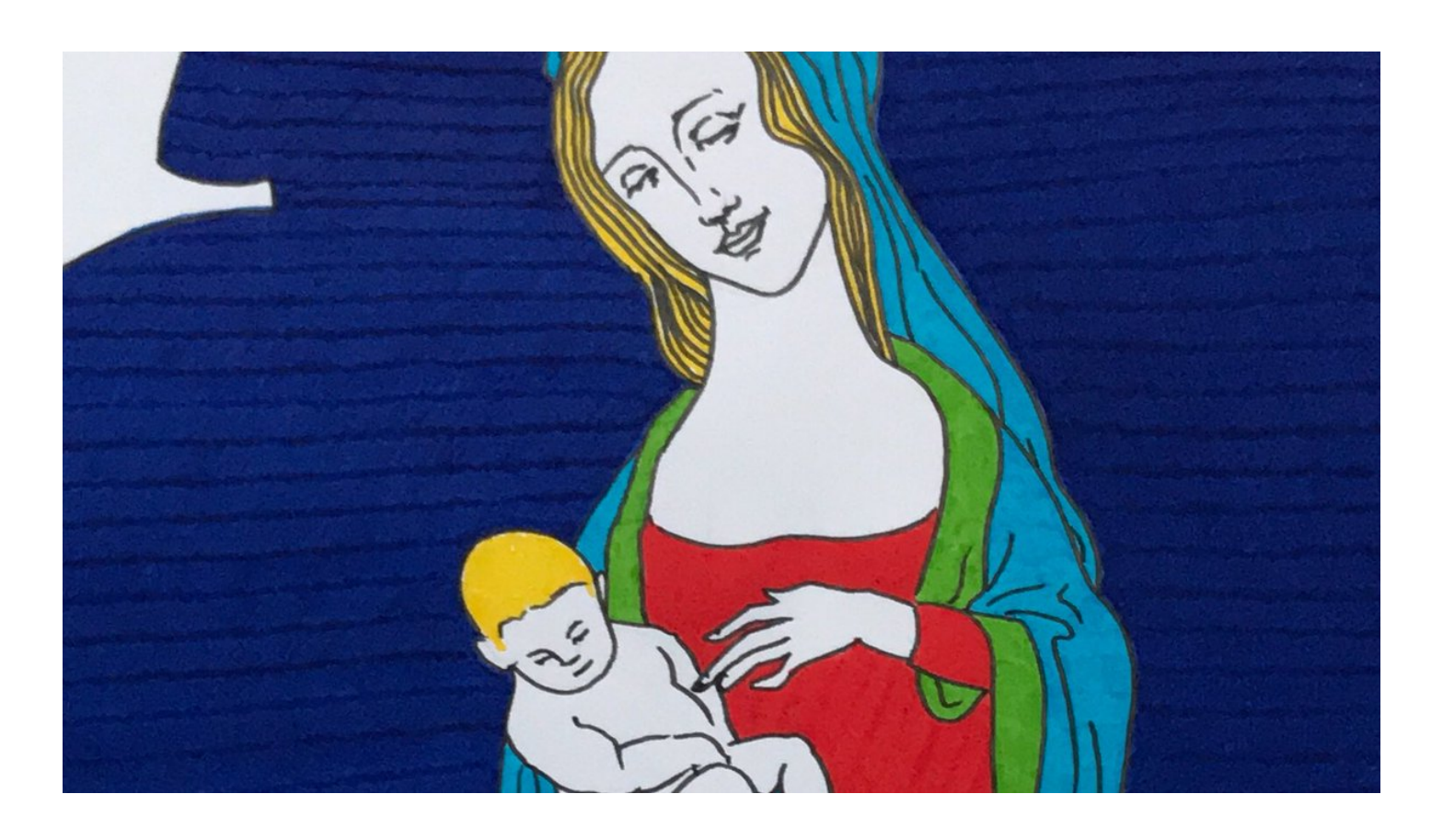
Just to be clear I'm not doing down religiosity or atheism. As long as each is personal, & not forced on others, we're grand!