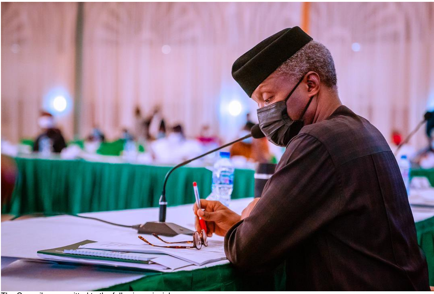
The Council recommitted to the following principles:

1. The protection of all residents of all States, including non-indigenous communities and religious and ethnic minorities