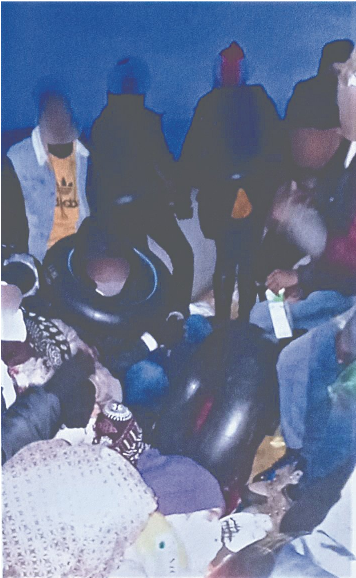
Members of Non-Governmental Organizations have been hiding hundreds of #immigrants in the last weeks in coastal caves and forests of the Aegean islands, in order not to be detected by the Greek coast guard and thus to facilitate their #illegal