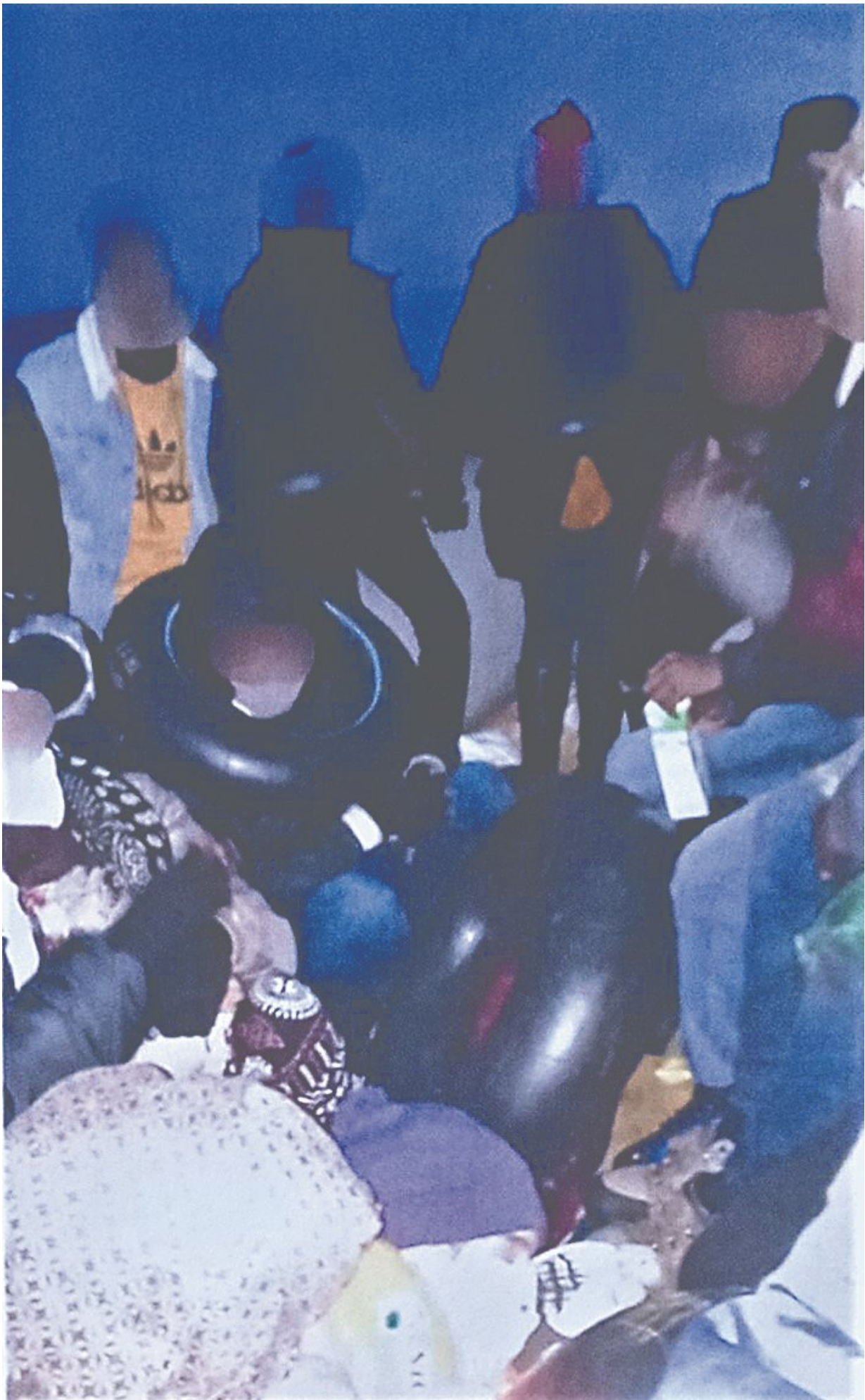
Members of Non-Governmental Organizations have been hiding hundreds of #immigrants in the last weeks in coastal caves and forests of the Aegean islands, in order not to be detected by the Greek coast guard and thus to facilitate their #illegal