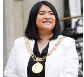
Cllr Hazel Chu DCC

We're now hearing from @SarahDuku , @Cairdelreland Coordinator in Ballbrigan, who is spotlighting the the views of people on a local level, on what must be addressed on the local and national level to achieve integration. #INIC2021