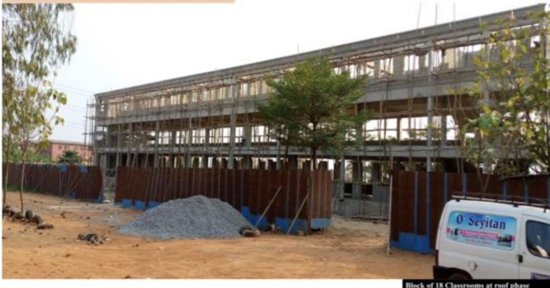
Block of 18 Classrooms at roof phase