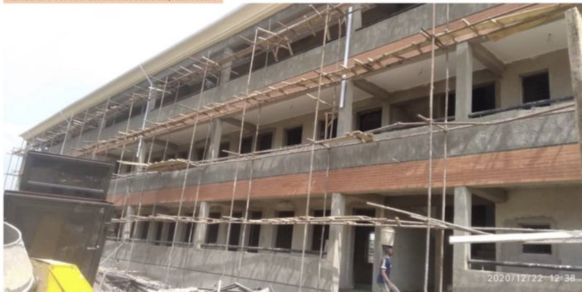
Block of 18 Classrooms at roof phase