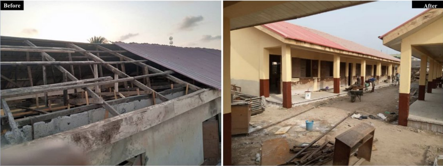
Renovation of classroom block