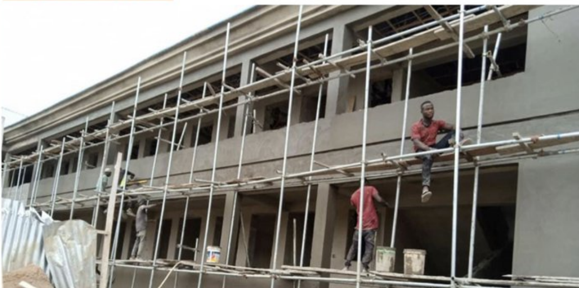
Block of 12 Classrooms at finishing phase