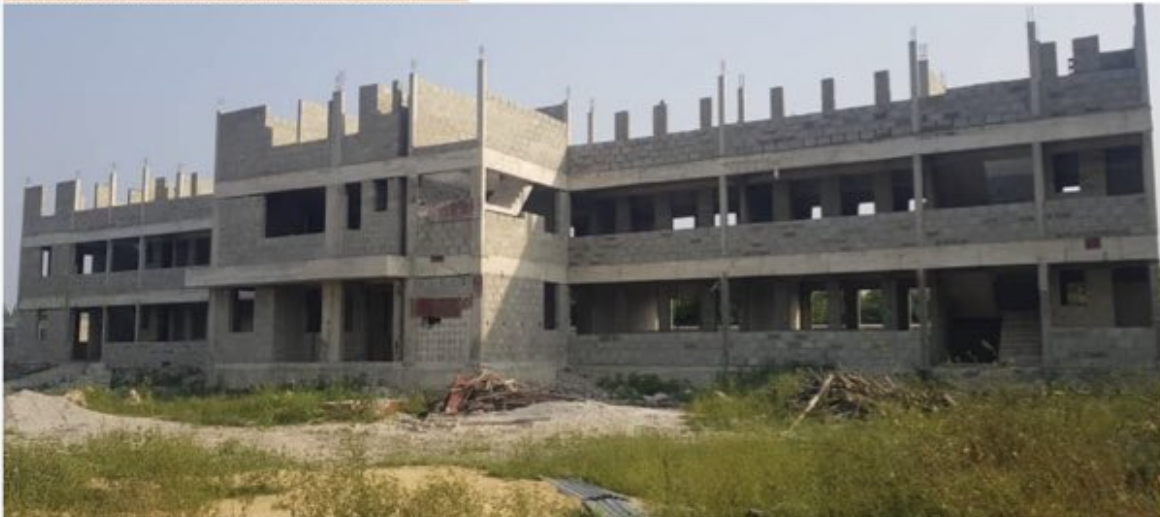
Block of 18 Classrooms at last floor/ roof phase