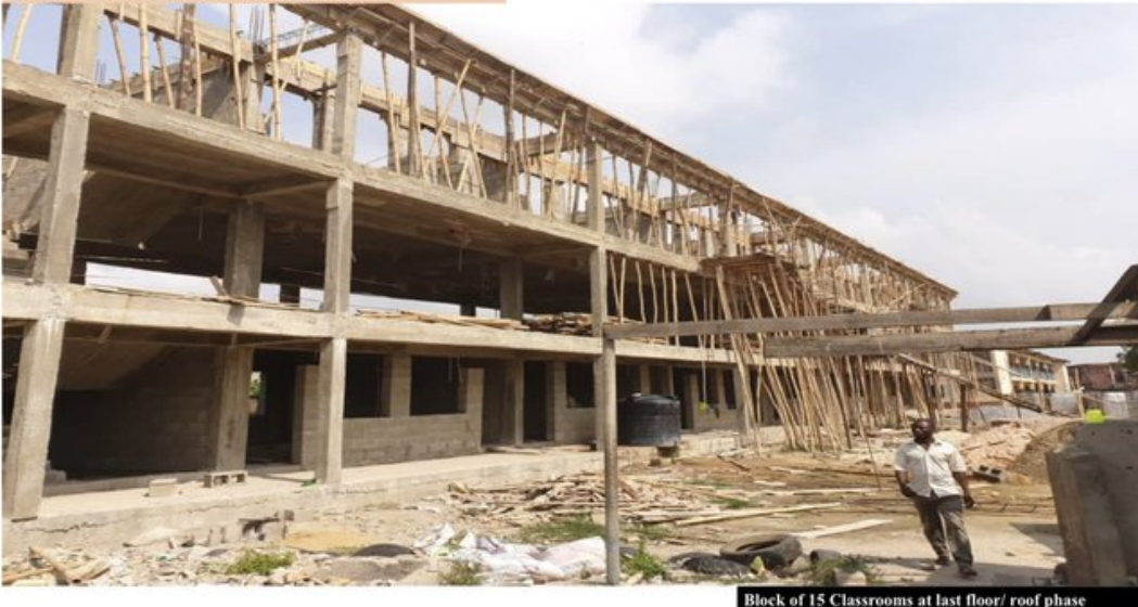
Block of 15 Classrooms at last floor/ roof phase