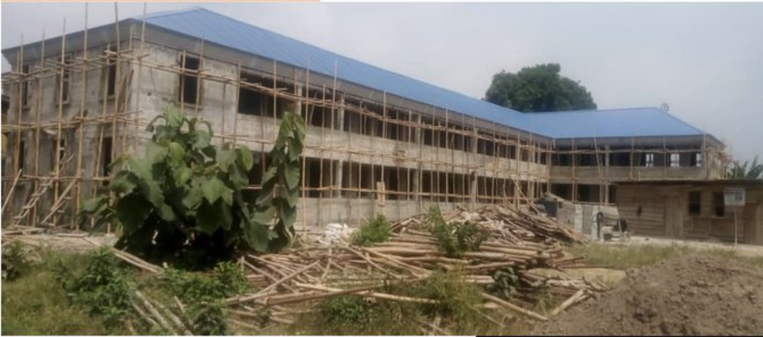
Block of 12 Classrooms at 2nd Fix and Finishing phase