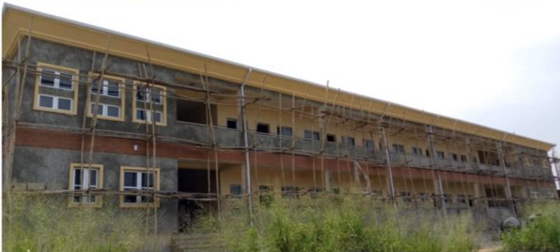
Block of Female Hostel at finishing phase