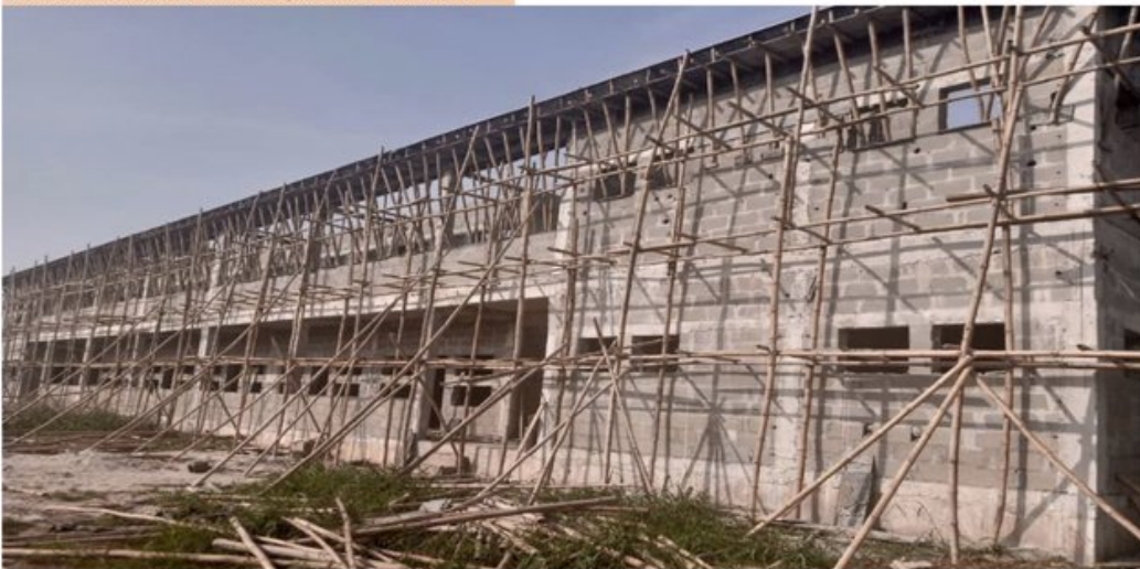
Block of Hostel at roof phase