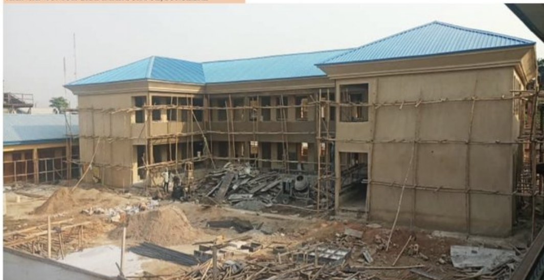
Block of 12 Classrooms at finishing phase