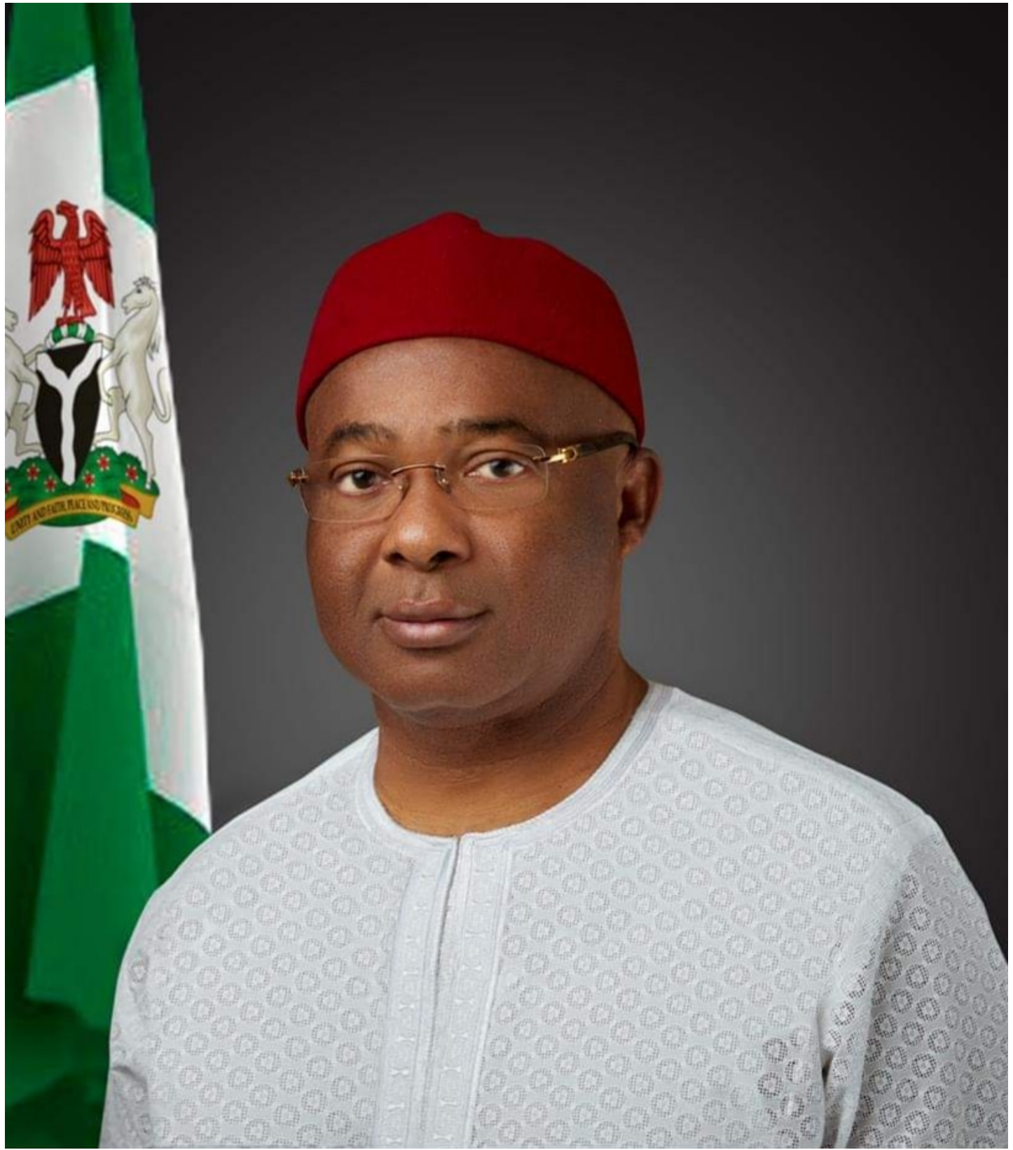
2/This afternoon, I received a very disturbing report on the activities of a group of Militants who unleashed a shooting spree in the Orlu area of the state, killing and maiming innocent citizen in the process.

3/I am totally appauled by this sad report which appears to paint a picture of near breakdown of law and order in the Orlu area. The government condemns in its entirety this act of extreme hooliganism and brigandage.