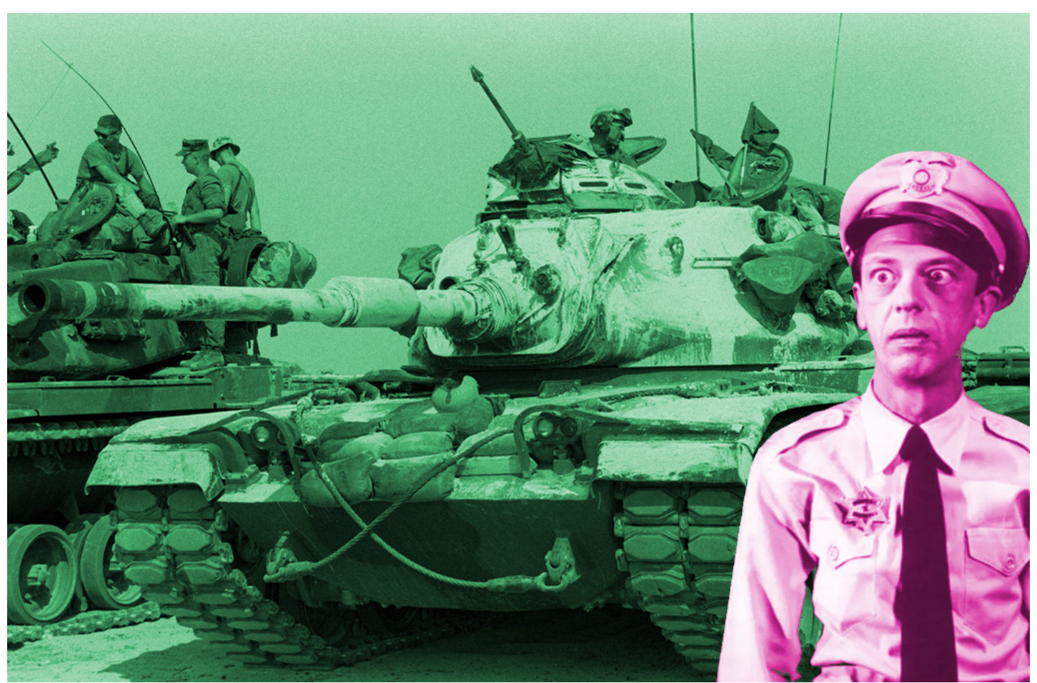
In the decades since, 1033 became a $5B industry: beltway bandits lobby their pals in the DoD to place massive orders for weapons and material which are immediately declared "surplus" and transferred to undertrained cops nationwide.