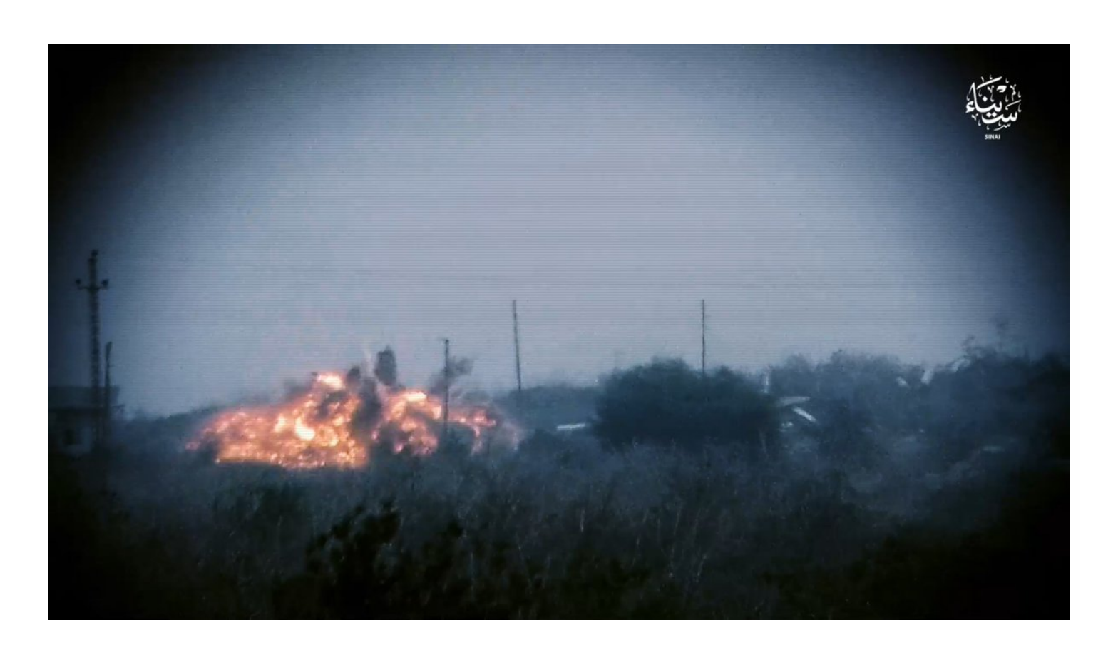
Also being laid in an anti personnel manner. Multiple targets are seen hit. Conventional close-range attacks are seen also.