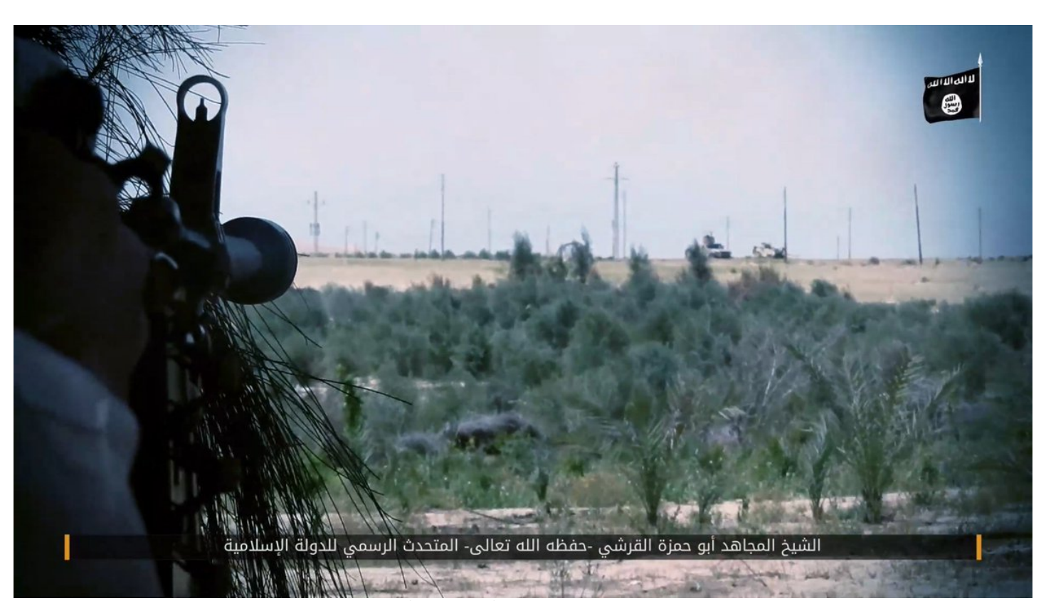
First, the most prominent feature of the video is (as always), large IEDs blowing up army vehicles, with varied effectiveness. This has been a constant for years by now.