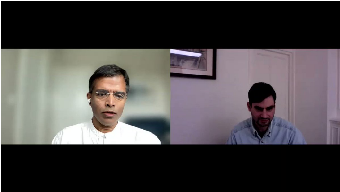
On copying Warren Buffett: