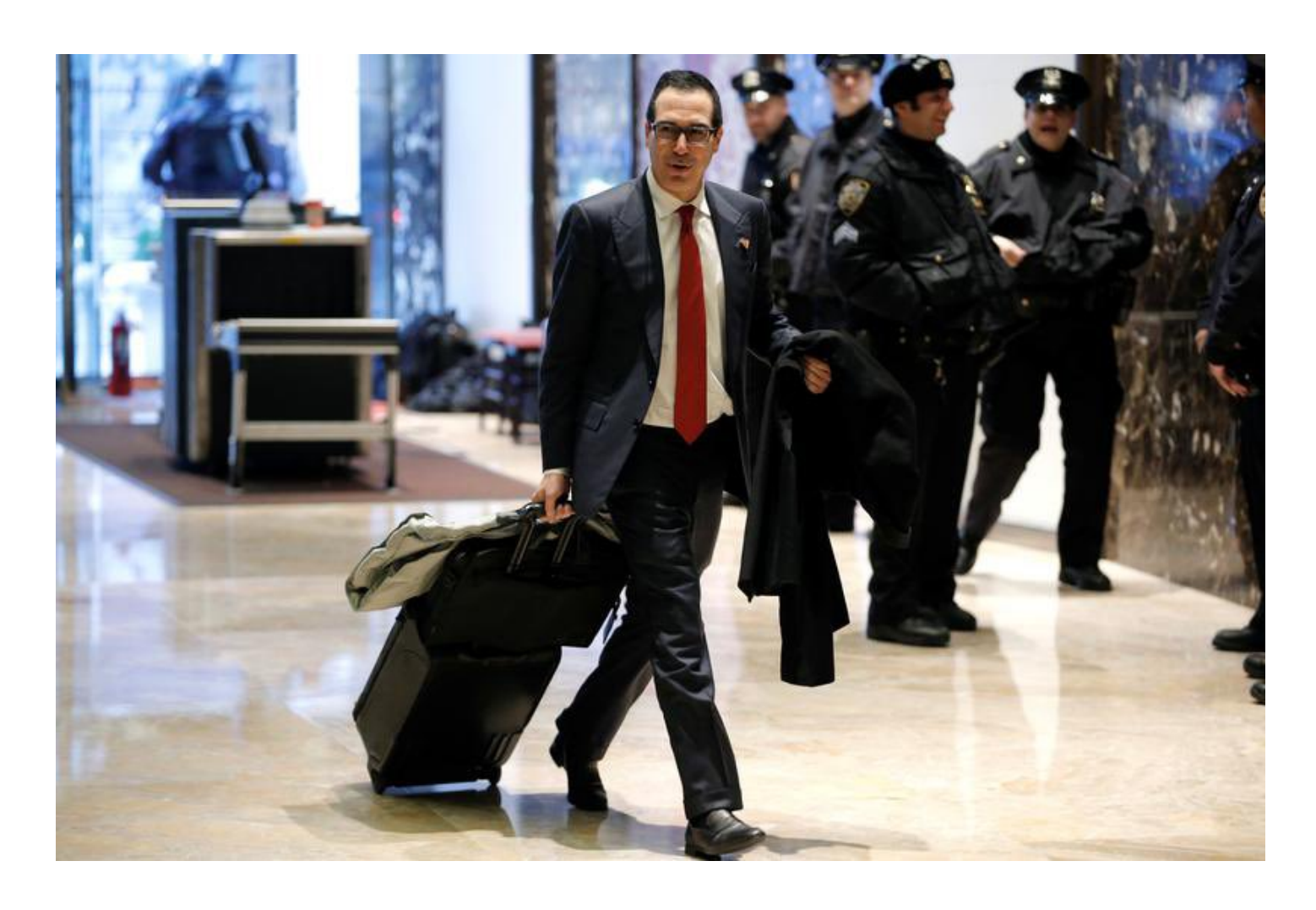
Weird luggage dude. Bye.