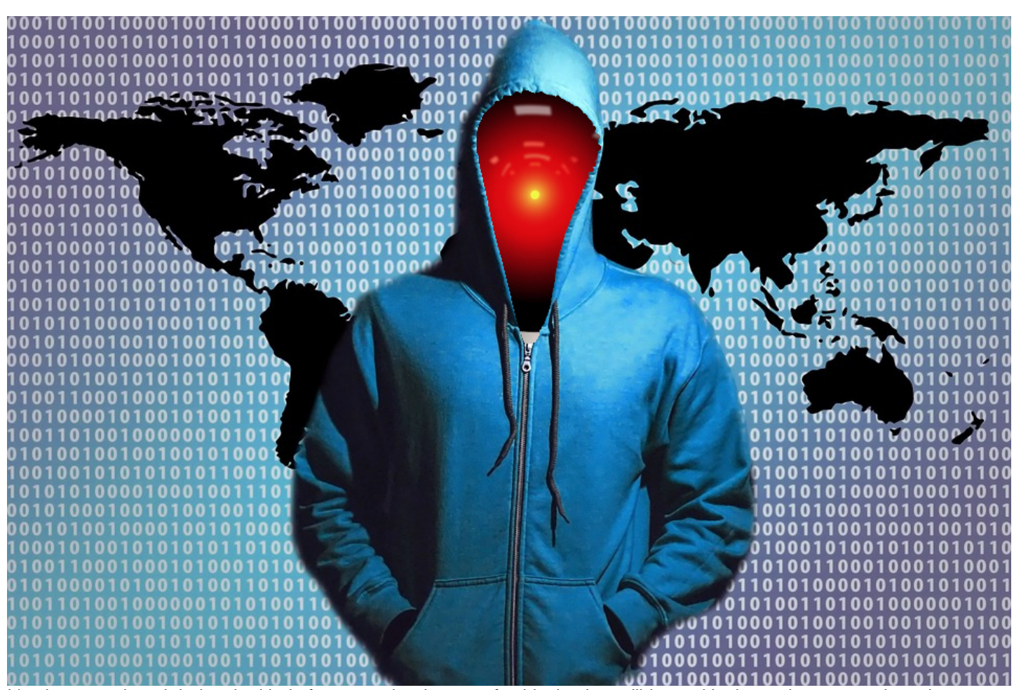
It's almost as though being the kind of person who dreams of achieving incredible wealthy by spying on people makes you kind of an asshole.