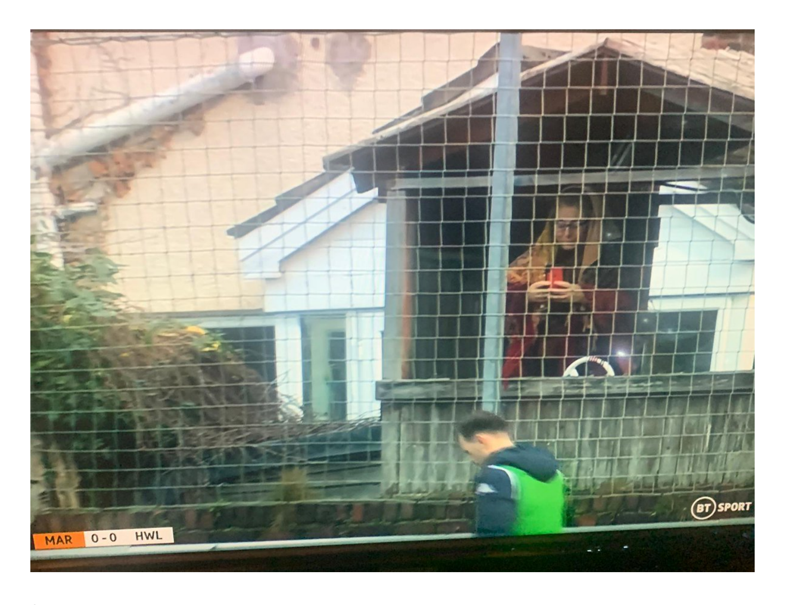
Second striker - Banana birthday girl - partial to a slip in the penalty box.