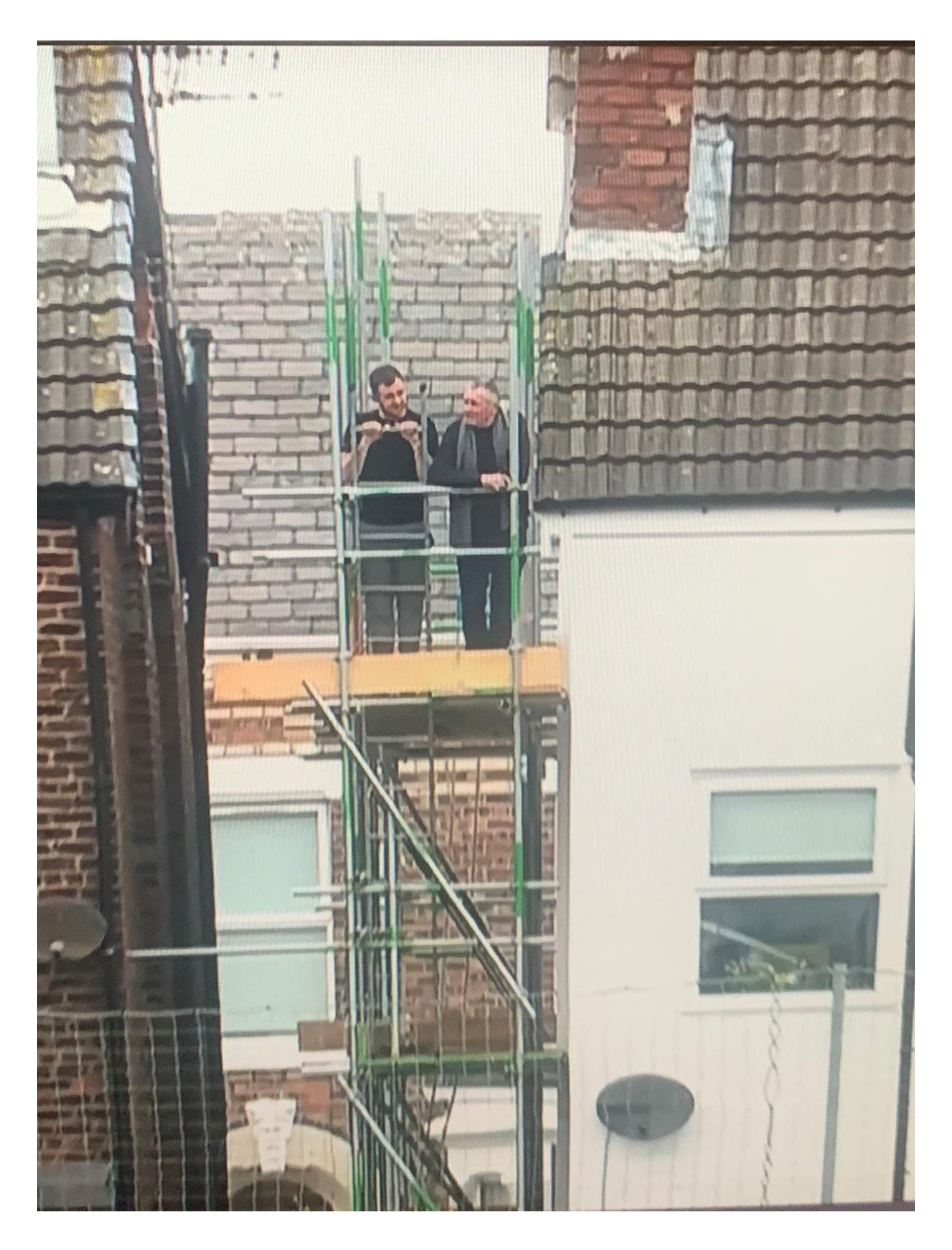
Full-backs - the Jones brothers from No. 23 - Always give the opposition a roasting. Different gravy.