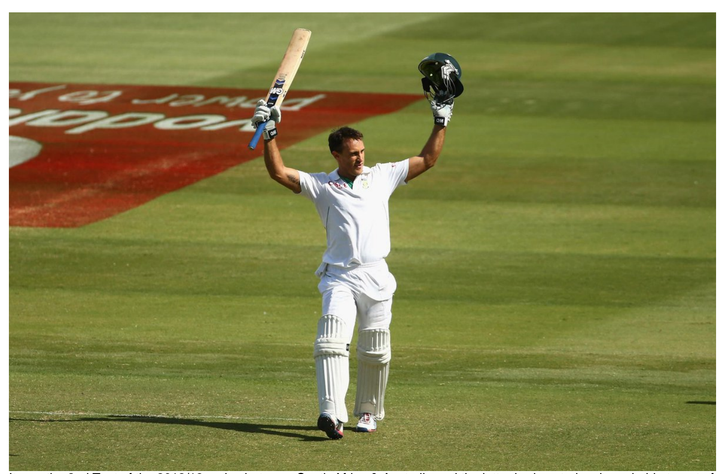
It was the 2nd Test of the 2012/13 series between South Africa & Australia and the latter had posted an improbable target of 430 for the visitors to chase in the 4th inn.

He made 110* off 376 deliveries and secured a draw for SA!