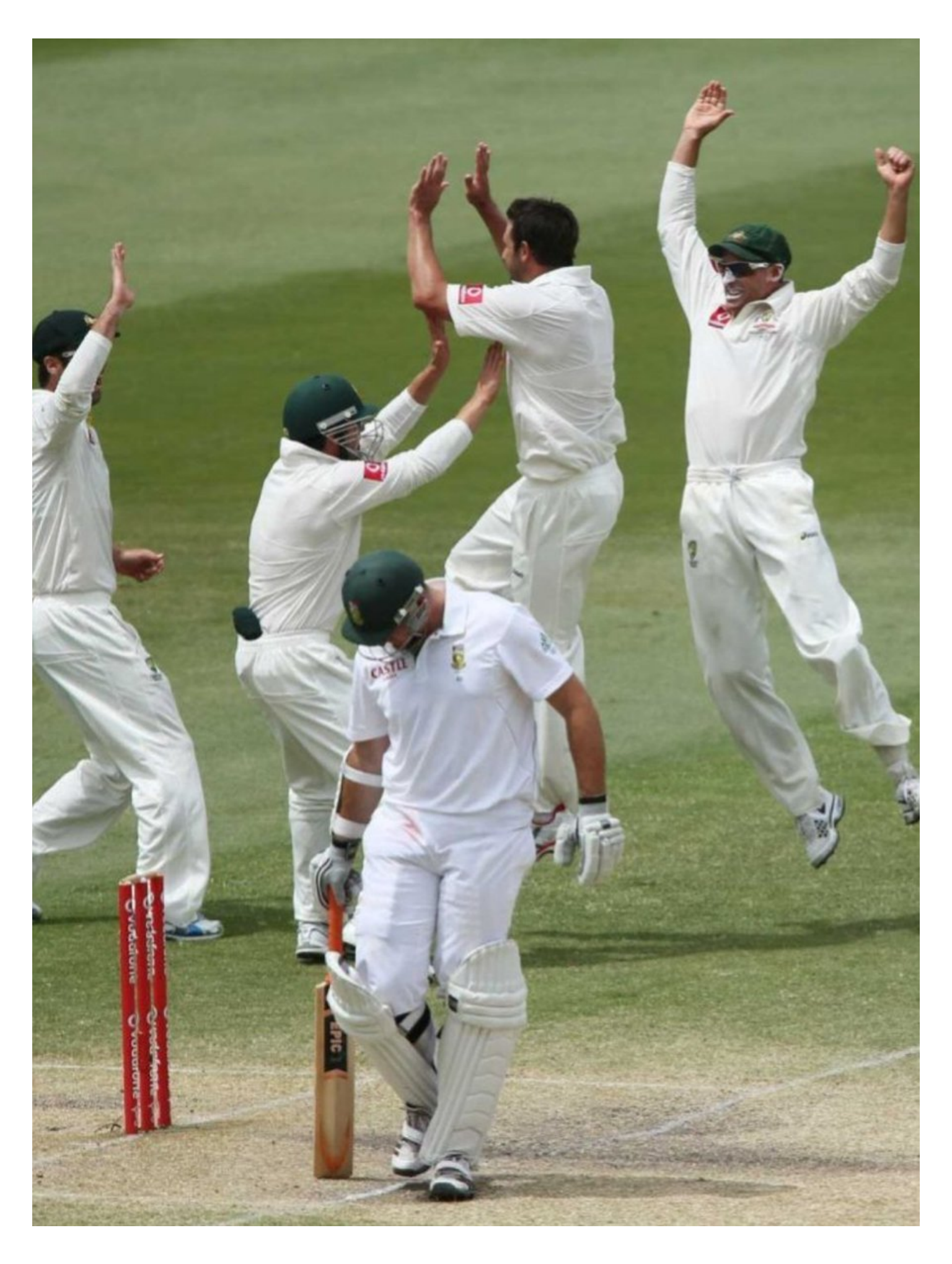
In walked du Plessis, joining de Villiers in one of the most fascinating blockathons in modern-day cricket. The latter took an uncharacteristically defensive approach, consuming 220 deliveries for his 33. The fall of AB's wicket did not deter du Plessis