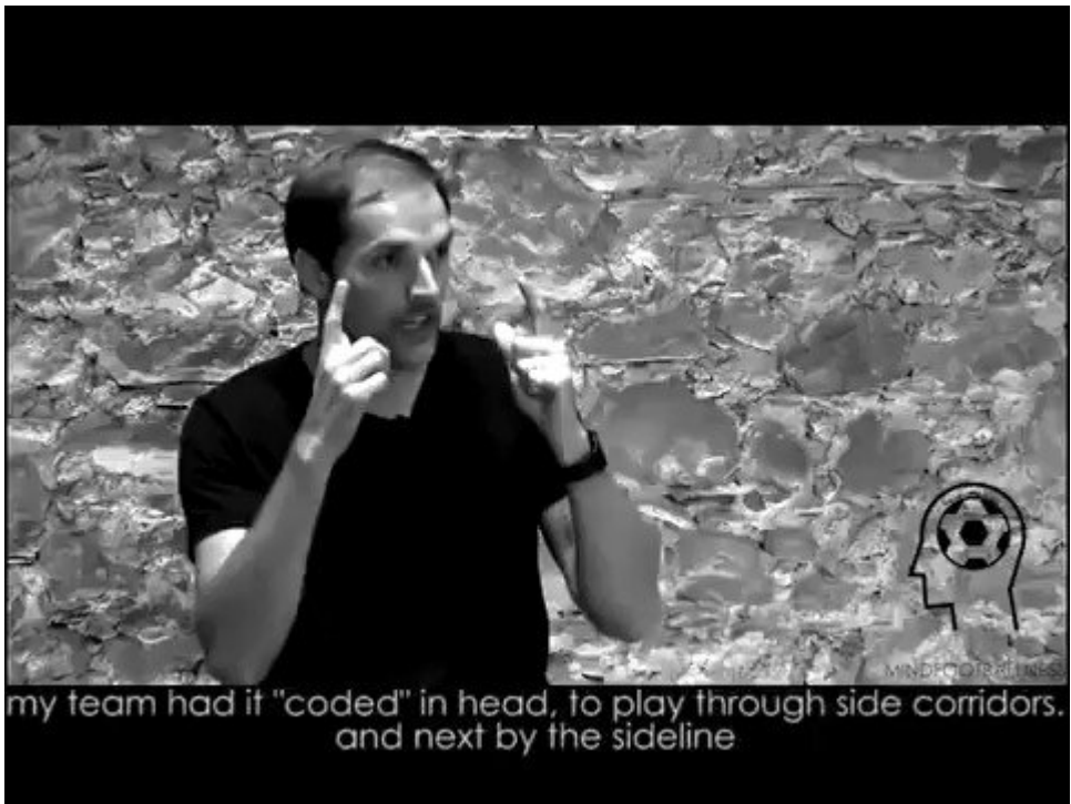
Tuchel on managing players — At a club like PSG or Chelsea, you're likely to see some of the most promising attackers on the planet. Instead of remote-controlling them on the pitch, it is better to give them a basic framework followed by freedom.