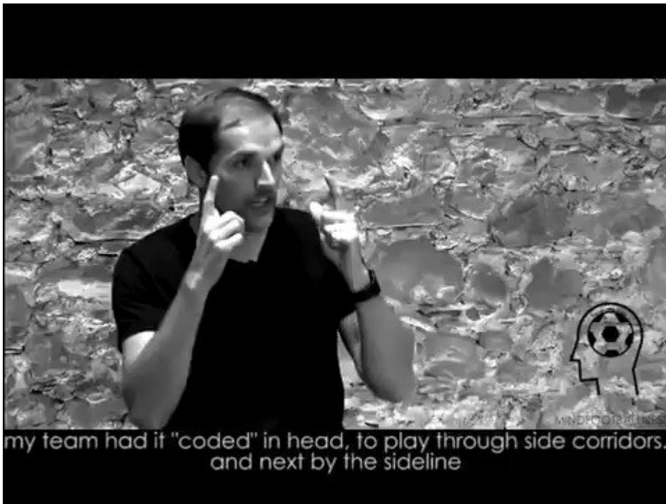
Tuchel on managing players — At a club like PSG or Chelsea, you're likely to see some of the most promising attackers on the planet. Instead of remote-controlling them on the pitch, it is better to give them a basic framework followed by freedom.