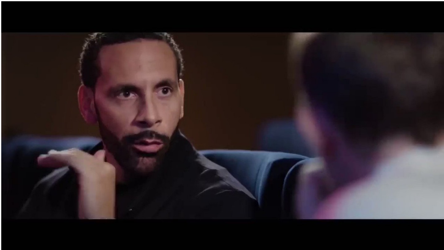
Tuchel on motivating players — The likes of Neymar, Ousmane Dembele and Mbappe have supernatural talent. The duty of the coach is to challenge and motivate that talent to express itself by creating uniquely challenging circumstances.