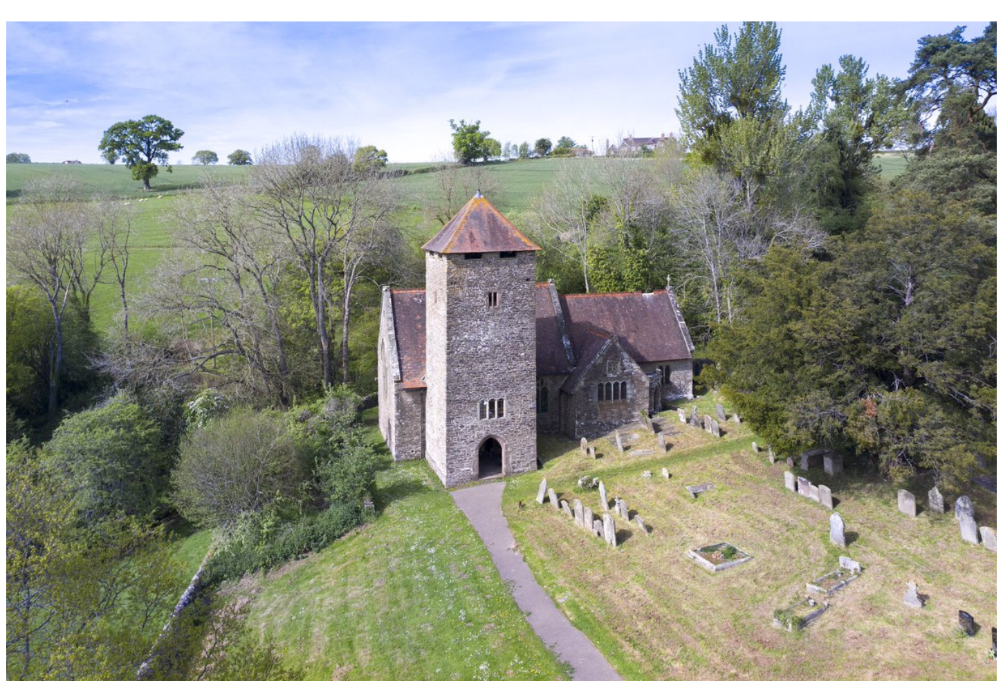
St Helen's, Barmby-on-the-Marsh, Yorkshire closed in 2007. The earliest record of a chapel here dates to 1388. In 1489, the parishioners petitioned at Rome for a grander church. This was granted. Only the nave survives from this date.

The churches we've saved in 2020 are... #thread