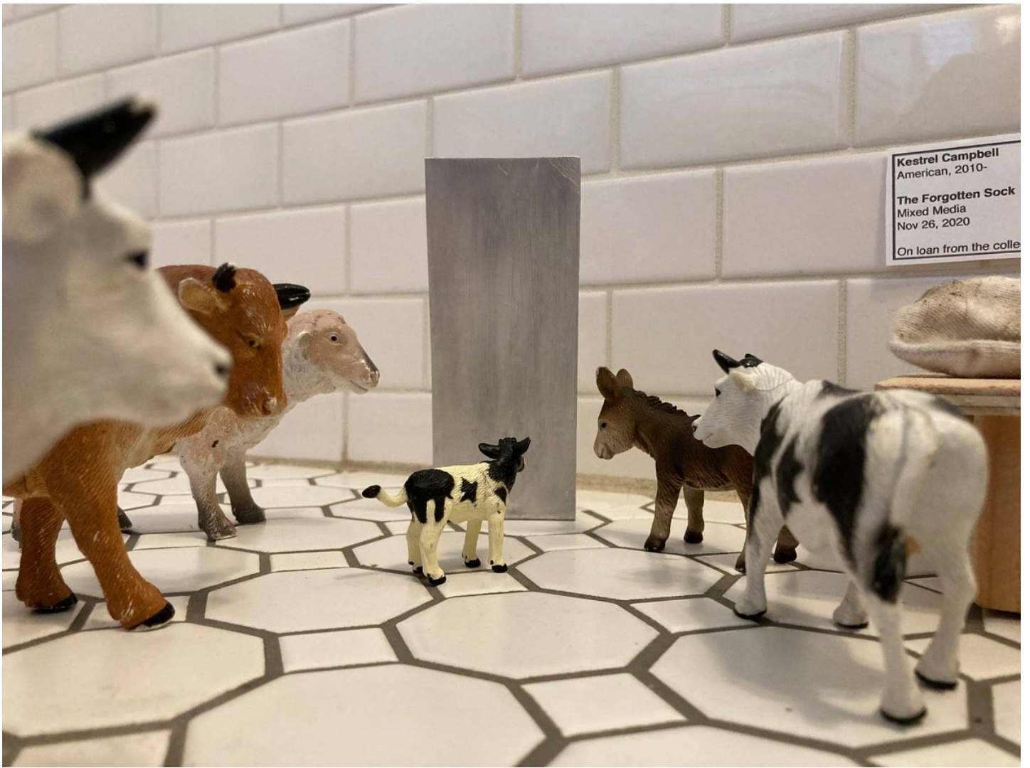
after walking the dog and this had appeared.