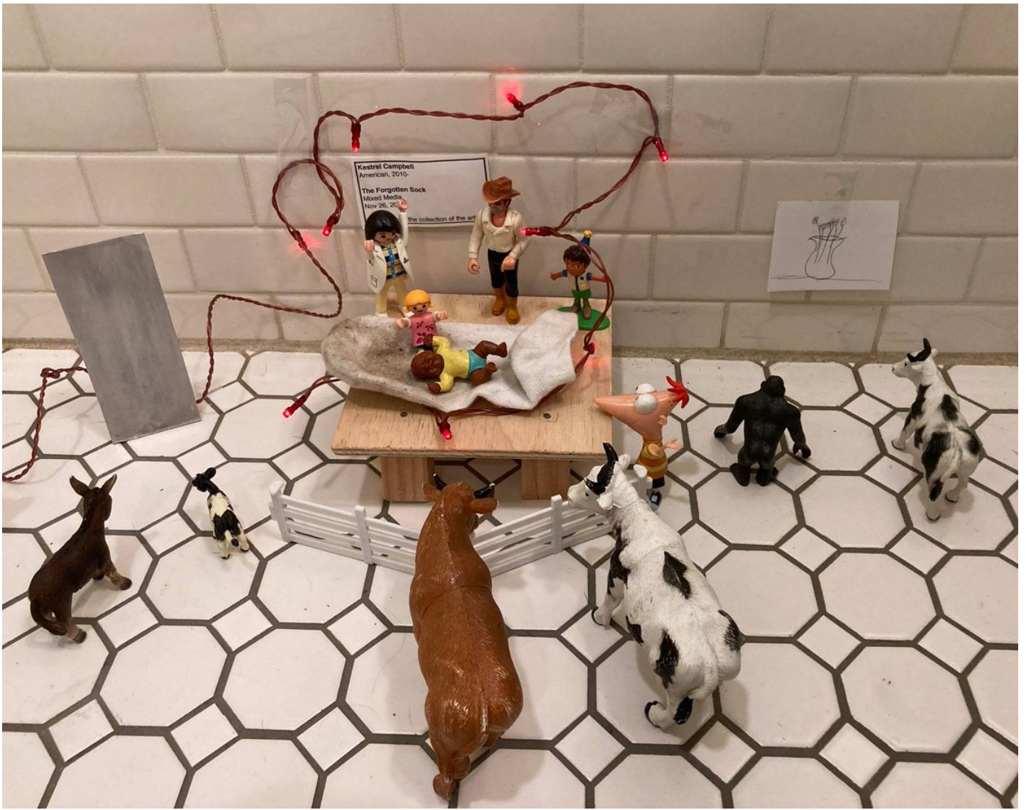
They "herd" about the party.