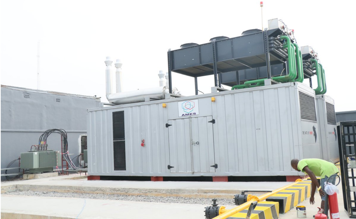
Ikot Ekpene – Alaoji – Ugwuaji Switching Station and Transmission Line