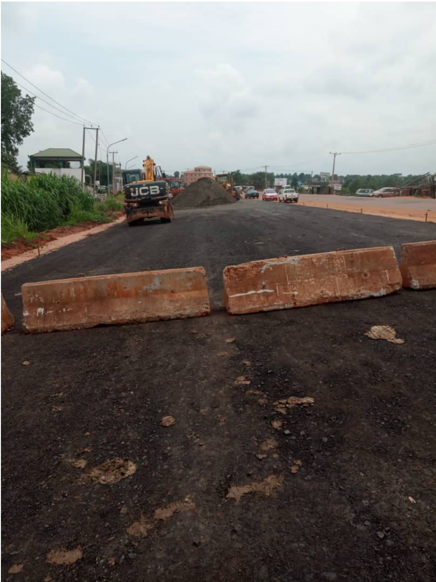
Rehabilitation of Sections 1 to 4 of the Enugu–Port Harcourt Expressway (Sukuk Bond) ongoing