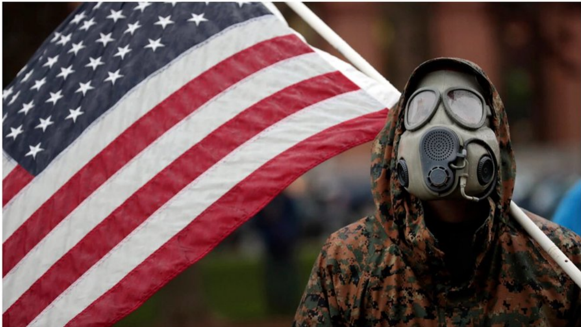
A person in a gas mask protests Gov. Gretchen Whitmer's pandemic policies at the Michigan State Capitol in May 2020

As Albertans, we are unfamiliar with the tactics used by fascists. Albertans are naive to subterfuge and sedition.