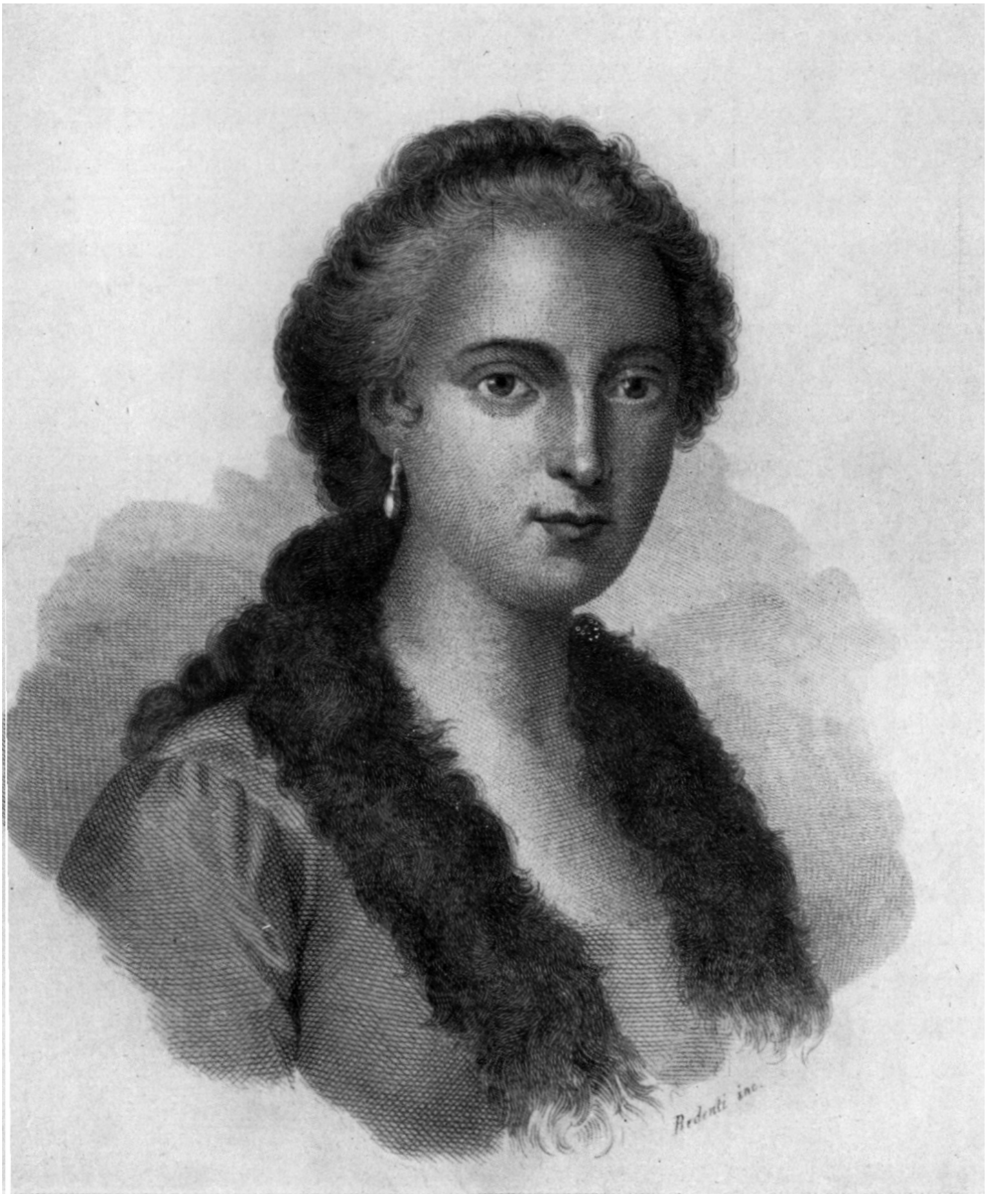
Nettie Stevens discovered the XY sex-determination system.