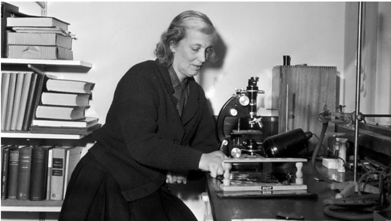
Sophia Jex-Blake fought for women's rights to study medicine. She was involved in founding two medical schools for women.

"It seemed discreditable to Great Britain that all her daughters who desired a University education should be driven abroad to seek it."