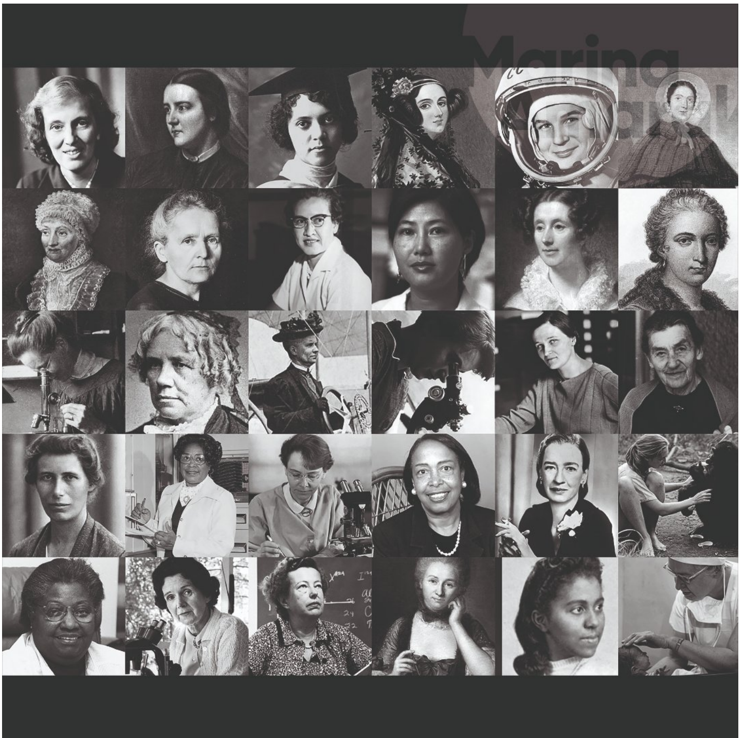
Dorothy Hodgkin discovered the structure of insulin after 36 years of work.

"I was captured for life by chemistry and by crystals."