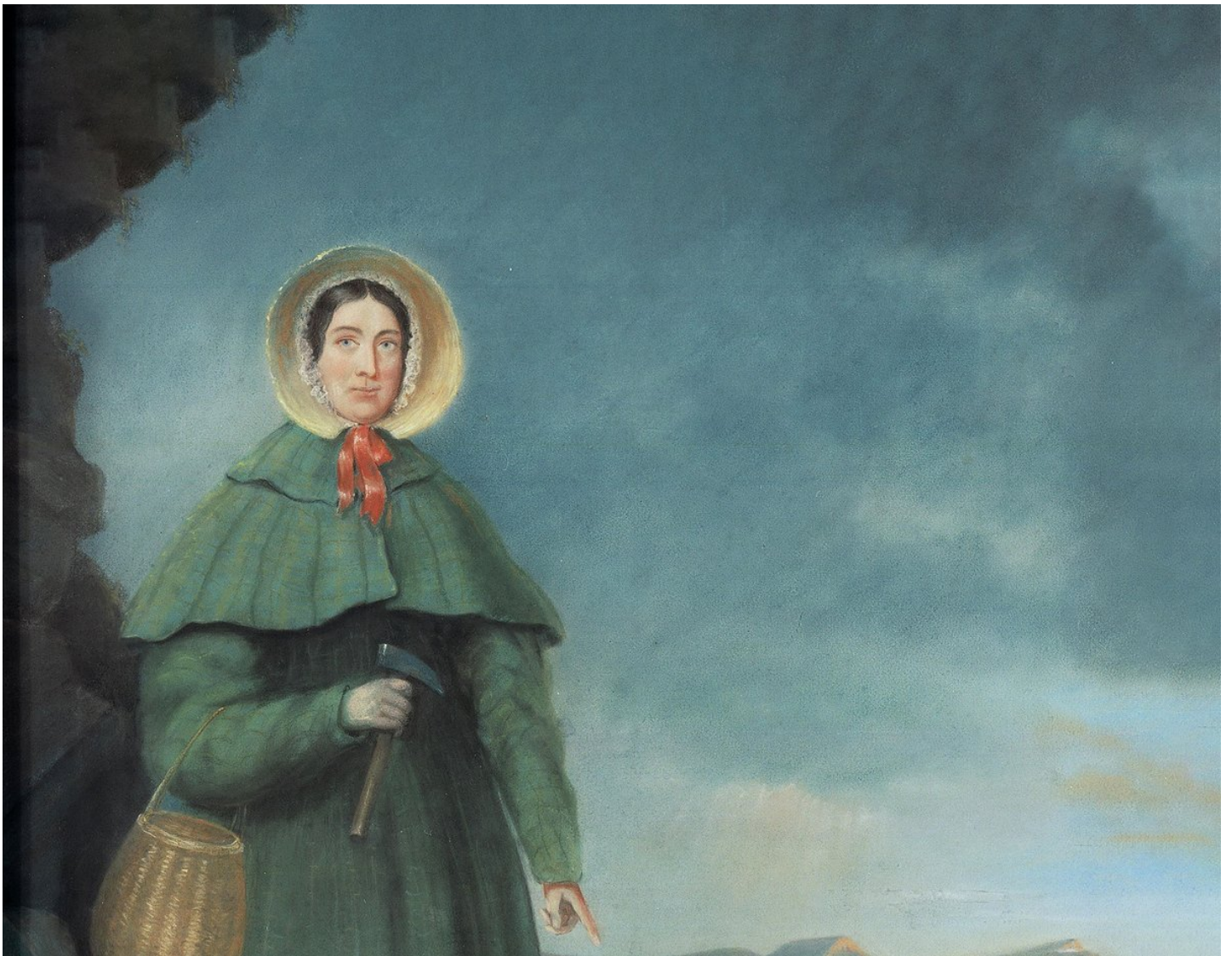
Caroline Herschel was the first woman to discover a comet (she would spot seven more). She also detected three nebulae, in 1783.