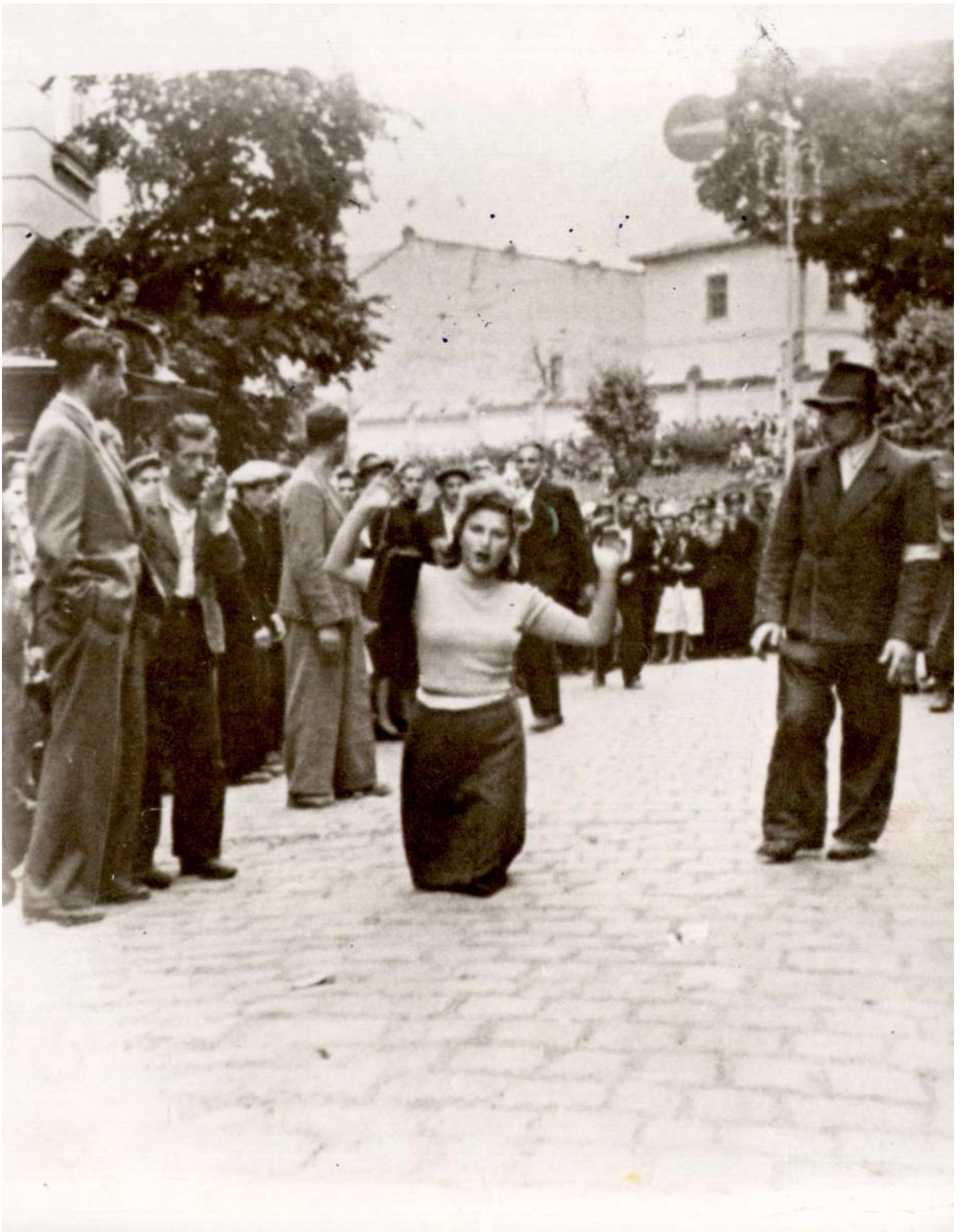
Here is Nazi newsreel footage of the assaults.