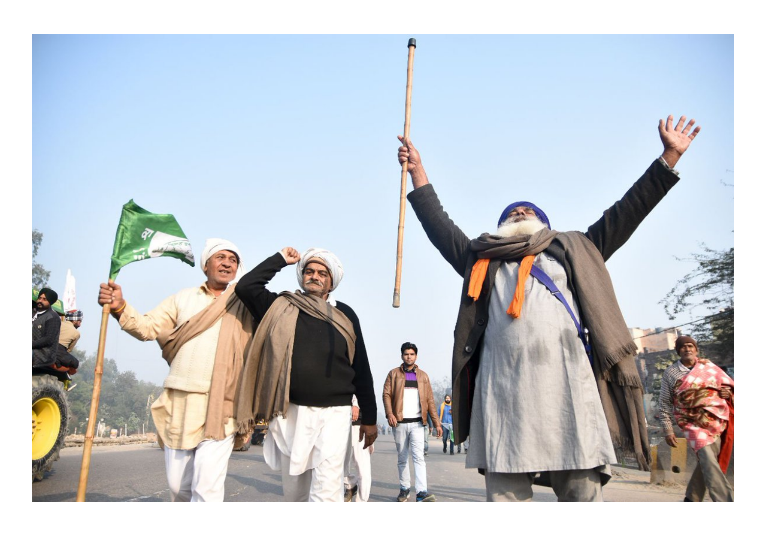
4/6. Please remember that the government has pledged to double farmers' incomes by 2022 – 12 months from now. A herculean task. That's what makes the disruptive interference of the Rihannas and Thunbergs all the more annoying. #FarmersProtests