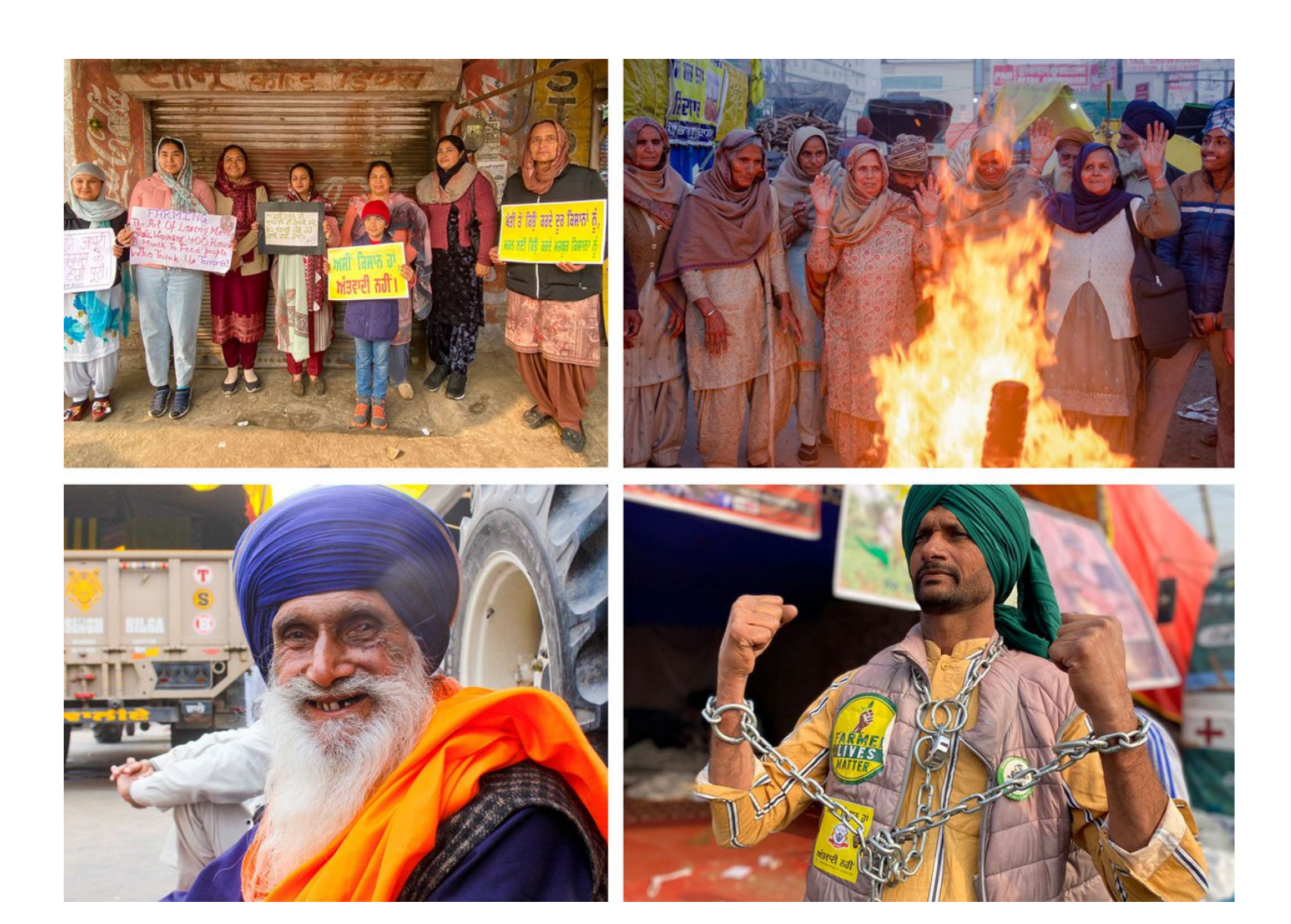
3/6. Sure they're better off than farmers in, say, Gujarat: Farm household avg. 5.2 persons, Avg. monthly income Rs. 7,926 (or Rs. 1,524 per capita). All India average: farm household 5.1. Avg. monthly household income Rs. 6,426. Per capita barely Rs. 1,300 #FarmersProtests