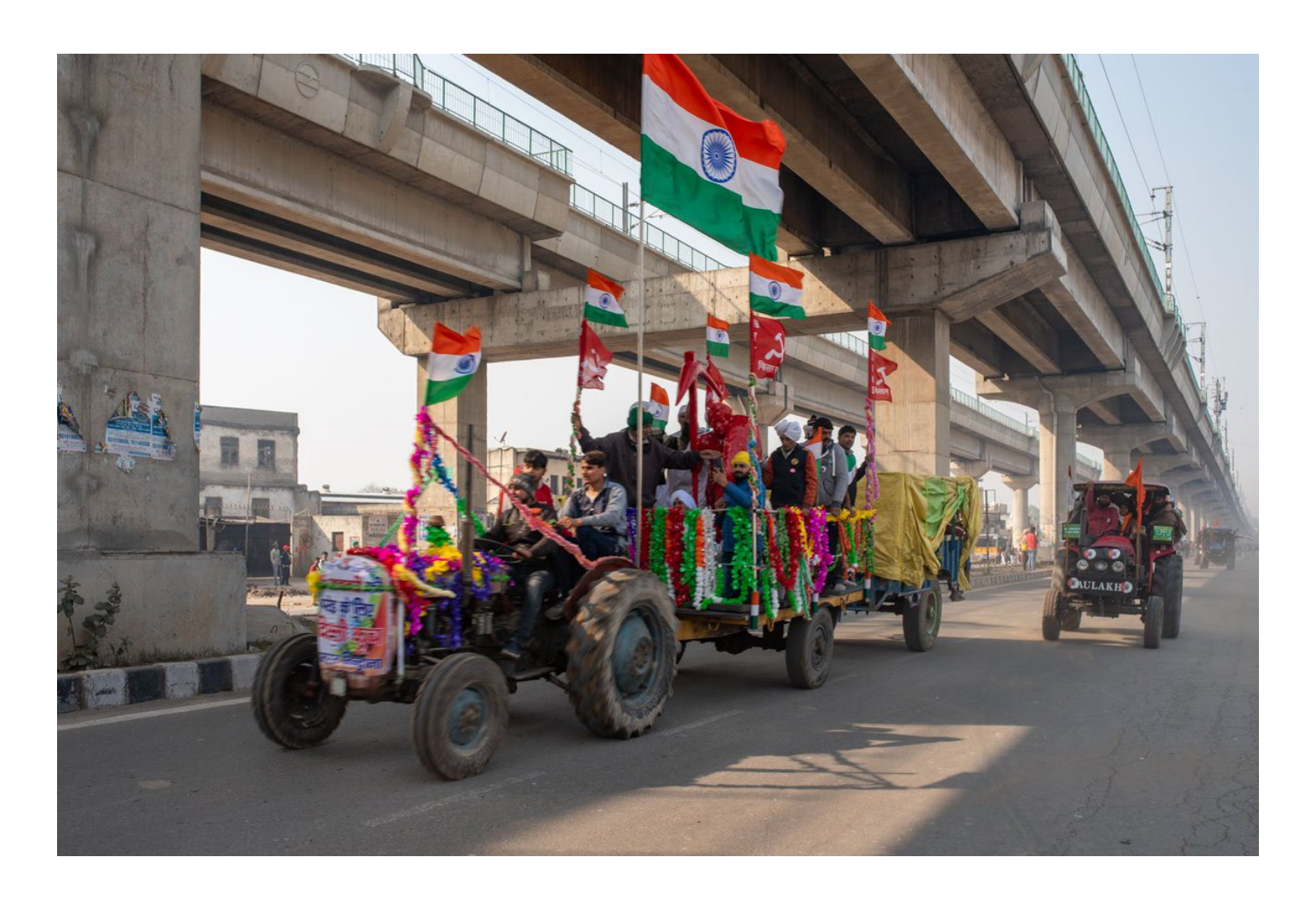
6/6. Funny. Some of the great names trashing the "rich farmers" on media are people who make more money in a day than an entire farm household of 5 in Punjab or Haryana earns in a month. #FarmersProtests