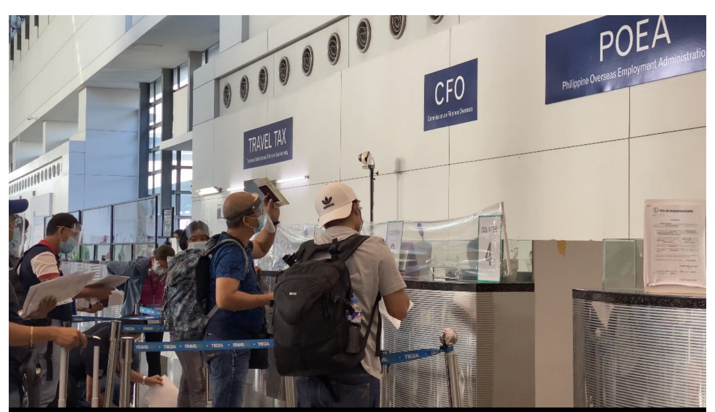
While abroad, register online thru <a href="https://t.co/UdiHtsAnQf">https://t.co/OVdadfbXX0</a> for seafarers and secure your unique QR Code.

OFW planning to fly back to the Philippines? Follow this thread to learn more about the process one has to go through from planning to arrival: