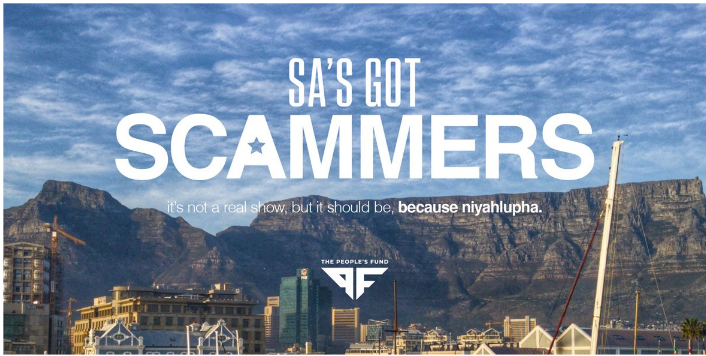
#UyaScammer99 #PayBackTheMoney #SAsGotScammers #RespectTheCrowd #WeWontRestBafwethu

We source the capital we use to fund purchase orders from everyday people who contribute their hard-earned money towards building the country & have faith that their money will be paid back. 97% of the entrepreneurs we work with respect the crowd. Here is the 3% that are scammers