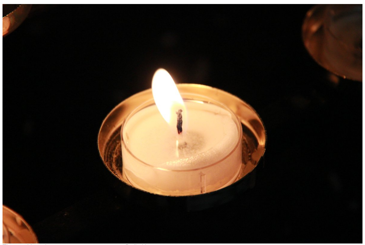
Those without internet access can access Daily Hope.

From prayers, services, reflections and music, our free phone line is available 24/7 on 0800 804 8044.