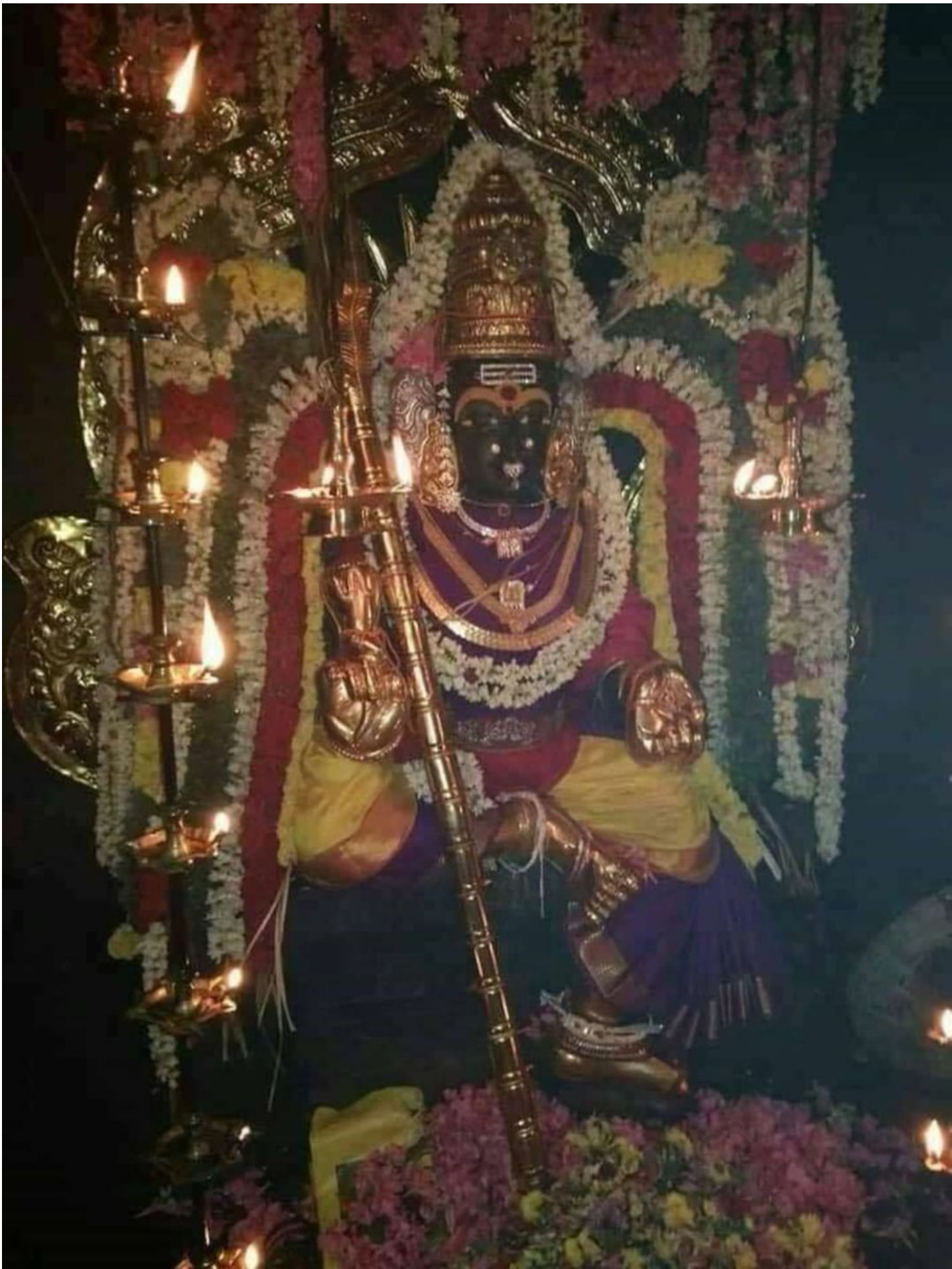
■ - respective owners