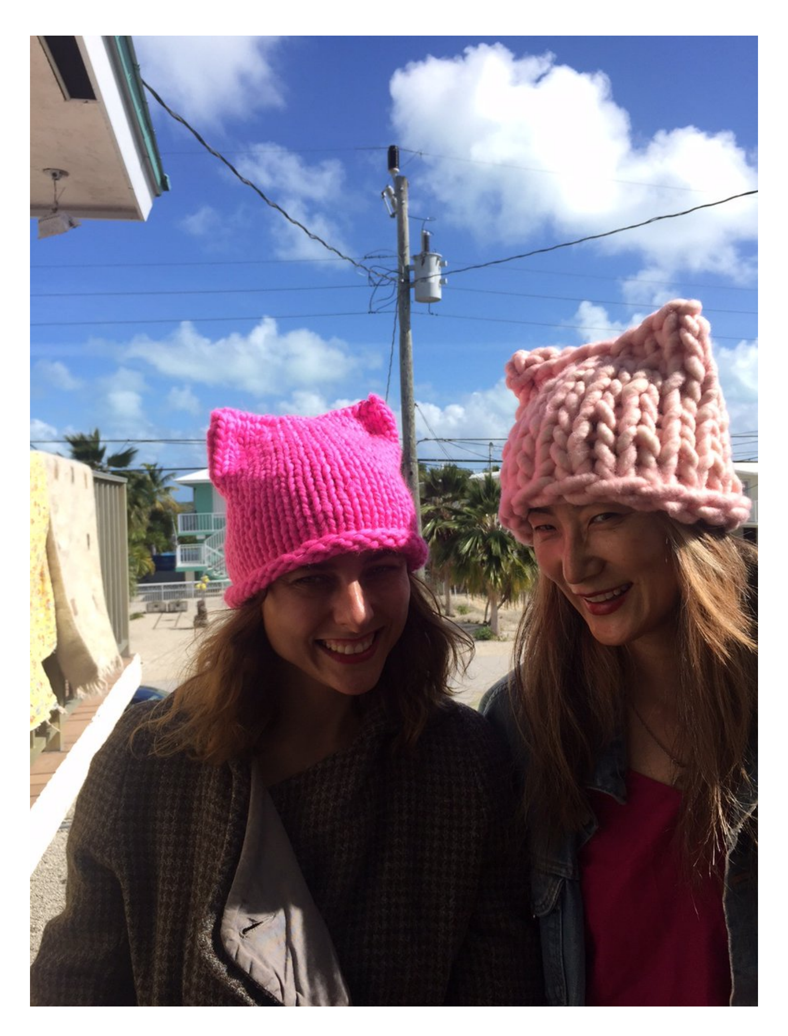
17/ bring back trad dress-ups.