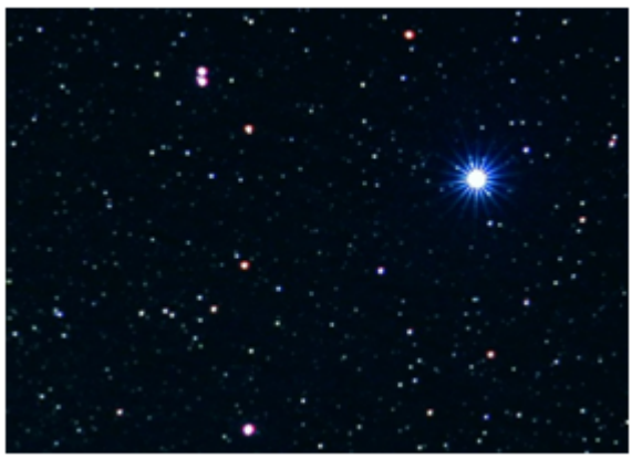
.... continuing from previous thread/story

RT & spread the knowledge. Any questions use #AskPratz