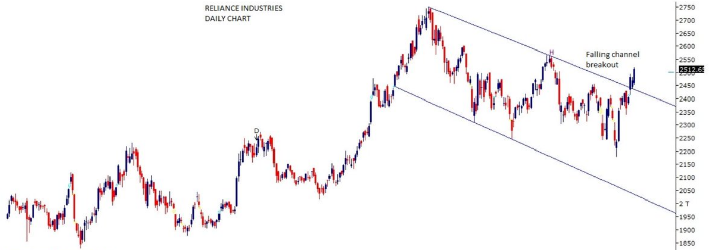
RELIANCE INDUSTRIES DAILY CHART