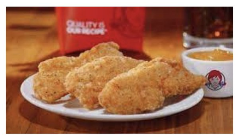
This, This right here.

Of course now im in, it makes perfect sense. Literally its the perfect stock for this sub, let me explain.