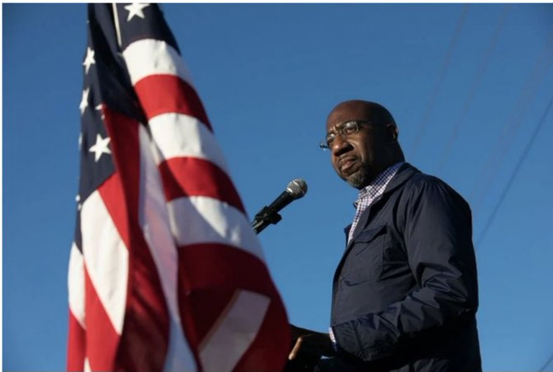
Georgia Senate hopeful Rev. Raphael Warnock