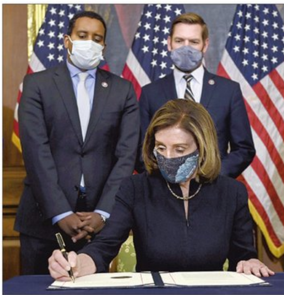
HOUSE SPEAKER Nancy Pelosi signs the article of impeachment against President Trump in the U.S. Capitol a week after the building was attacked by a mob. The president "incited this insurrection," she said.