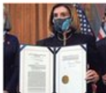
House Speaker Nancy Pelosi displays the signed article of impeachment.

Democrats voted unanimously to impeach President Donald Trump. Ten Republican lawmakers, including third-ranking House GOP leader Liz Cheney of Wyoming, broke ranks and voted to impeach Trump.