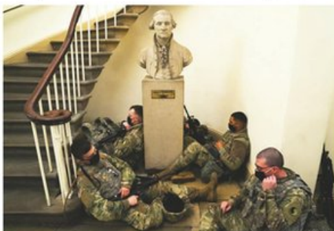
National Guardsmen rest in the U.S. Capitol on Wednesday. D.C.'s acting police chief said that upward of 20,000 guardsmen were expected to be in place as Inauguration Day approached.

One year later, a very different nation seethes