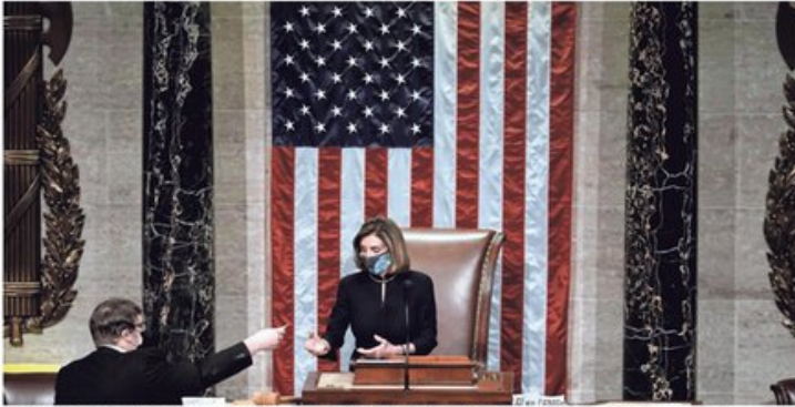
House Speaker Nancy Pelosi, D-Calif., receives the final vote of the impeachment of President Donald Trump on Wednesday for his role in inciting an angry mob to storm Congress last week.