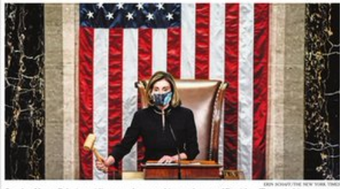
Speaker Nancy Pelosi presiding over the second impeachment of President Trump in his one term.