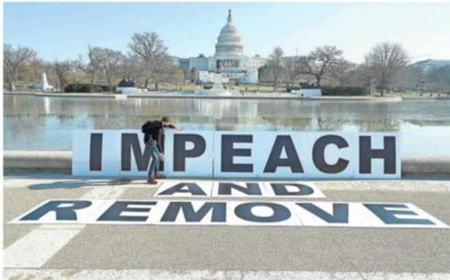
People gather at the base of the U.S. Capitol with large IMPEACH and REMOVE letters Wednesday in Washington, DC. The group is calling on congress to remove President Donald Trump from office on the day Democrats introduced articles of impeachment in response to his inciting an insurrection at the U.S. Capitol on Jan. 6.