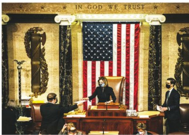
House Speaker Nancy Pelosi presides over a vote to impeach President Trump on Wednesday, exactly one week after a mob breached the Capitol. Ten Republicans broke ranks and joined Democrats in the effort. See excerpts from the debate at wapo.st/impeachment0114 .