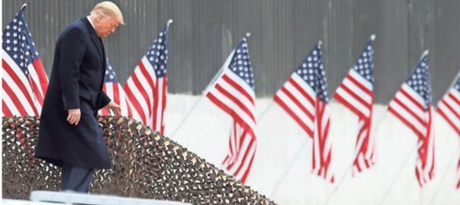
President Donald Trump descends steps near a section of the U.S.-Mexico border wall Tuesday in Alamo, Texas. Trump is the only U.S. president to be impeached twice. Wednesday's vote in the U.S. House of Representatives was the most bipartisan presidential impeachment in modern times.

10 in House GOP join call to oust president • Next step is trial in Senate