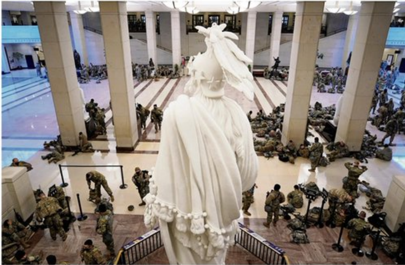
National Guard members assemble in the Capitol Visitor's Center before House lawmakers began debate Wednesday on impeaching President Donald Trump.