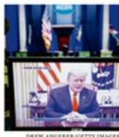
House Speaker Nancy Pelosi rapped her gavel after the historic vote, while a White House TV monitor later showed President Trump's recorded video.