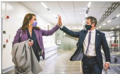
Republican Reps. Adam Kinzinger of Illinois, right, and Jaime Herrera Beutler of Washington, were two of 10 GOP House members to vote for impeachment.