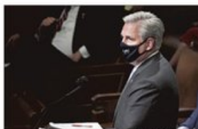
KEVIN MCCARTHY changed tack and said Trump "bears responsibility" for mob violence in the Capitol.