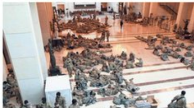
Hundreds of National Guard troops are seen inside the U.S. Capitol Visitor Center to reinforce security at the Capitol on Wednesday. The House voted 232-197 to impeach Trump.

Trump is the only U.S. president to be twice impeached. It was the most bipartisan presidential impeachment in modern