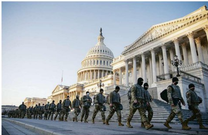
Members of the National Guard patrolled outside the Capitol on Wednesday, a marked contrast from the scene a week ago.

HOUSE VOTES 232-197 for article accusing him of "inciting violence against the government of the United States."