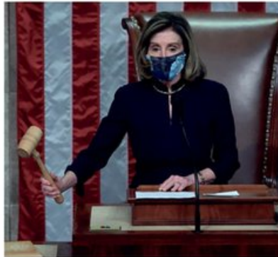
House Speaker Nancy Pelosi raps her gavel in the House Chamber of the U.S. Capitol on Wednesday in Washington, D.C., after the House voted to impeach U.S. President Donald Trump for the second time in little over a year.

Trump is the only U.S. president to be twice impeached. It was the most bipartisan presidential impeachment in modern times, more so than