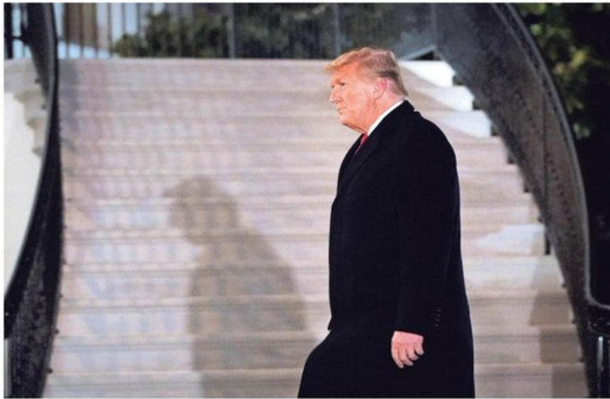
President Donald Trump, shown Tuesday in Washington, D.C., was impeached by the U.S. House for a historic second time on Wednesday.