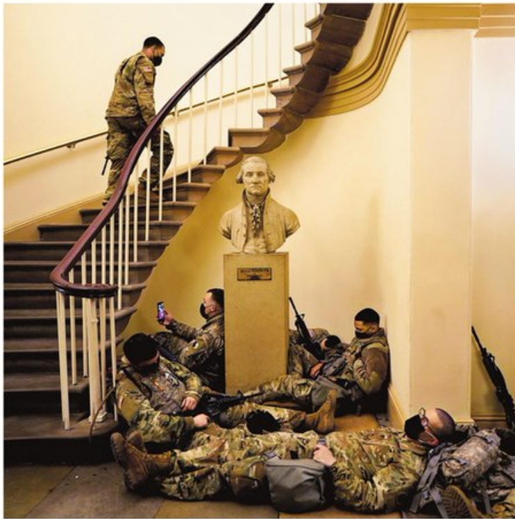
National Guard troops found a moment to rest under the gaze of George Washington on Wednesday as they patrolled the Capitol grounds.