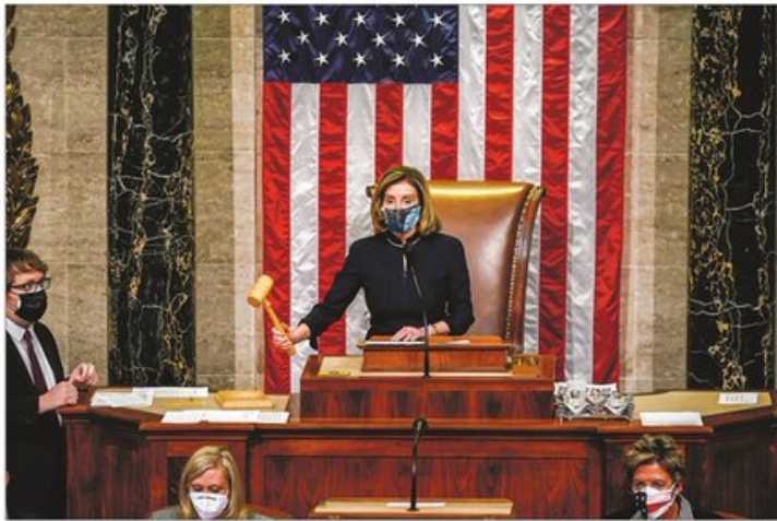
Speaker of the House Nancy Pelosi begins the impeachment vote of President Donald Trump on Wednesday. Trump became the only president to be impeached twice one week after a mob of his supporters stormed the U.S. Capitol in an action that took five lives.