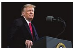
PRESIDENT TRUMP has hit a new low in polls, and leading Republicans are ready for a post-Trump era.