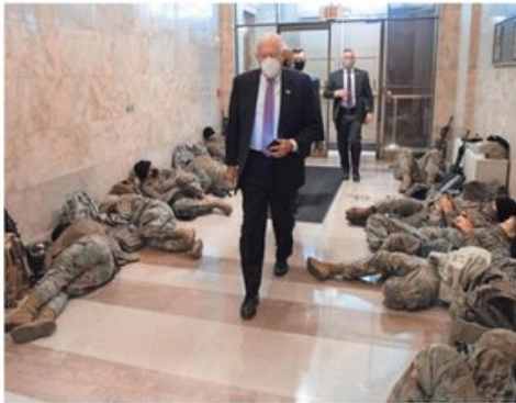
House Majority Leader Steny Hoyer, D-Maryland, walks past sleeping members of the National Guard as he arrives Wednesday at the U.S. Capitol ahead of a House vote impeaching President Donald Trump.

Wisconsin legislators' statements on the impeachment. Page 6A