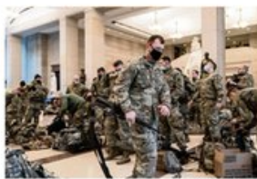
Hundreds of National Guard troops gather inside the Capitol in Washington, D.C., on Wednesday.

Reps. Carlos Gimenez, Mario Diaz-Balart and Maria Elvira Salazar voted against the one article of impeachment, titled "incitement of insurrection" and drafted by Democrats within hours of last week's riot. Every Democrat in the House, in-