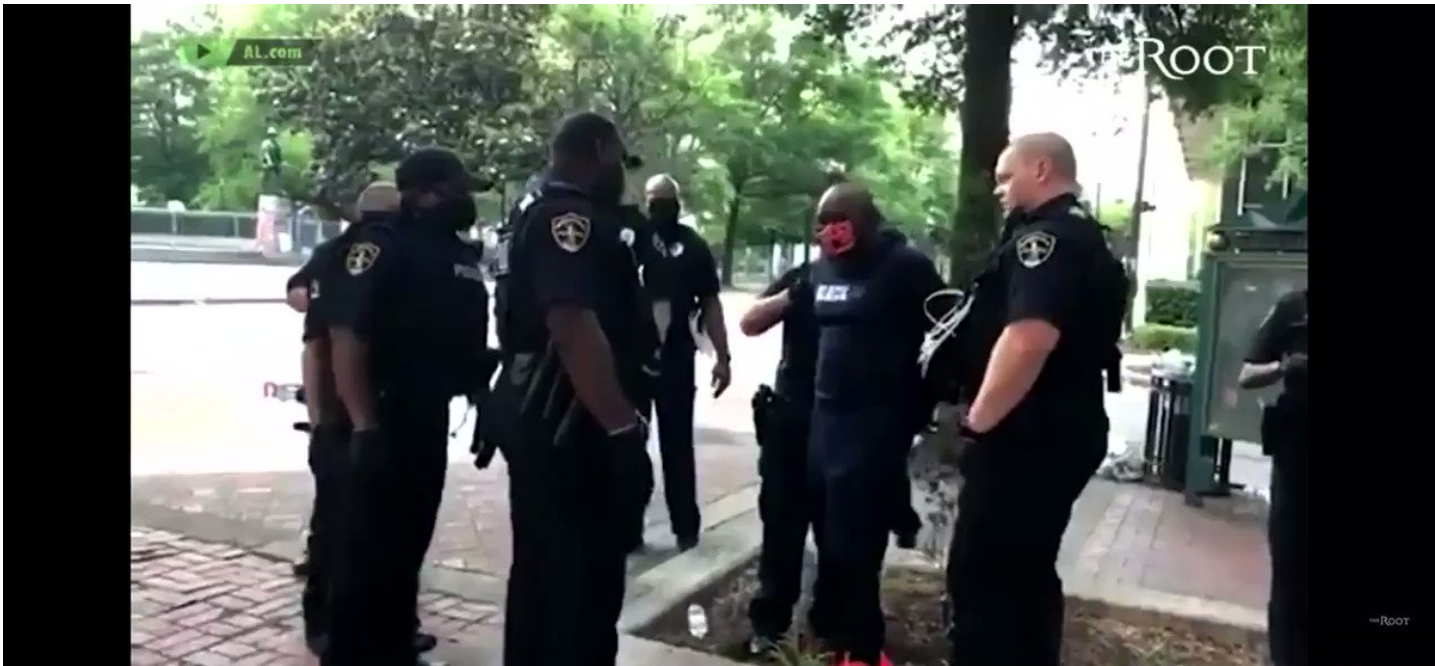
Here's what happened when they stormed the capital in Michigan