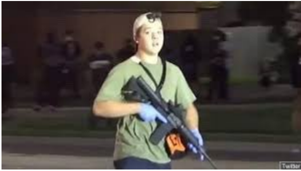
Here's me in Ferguson