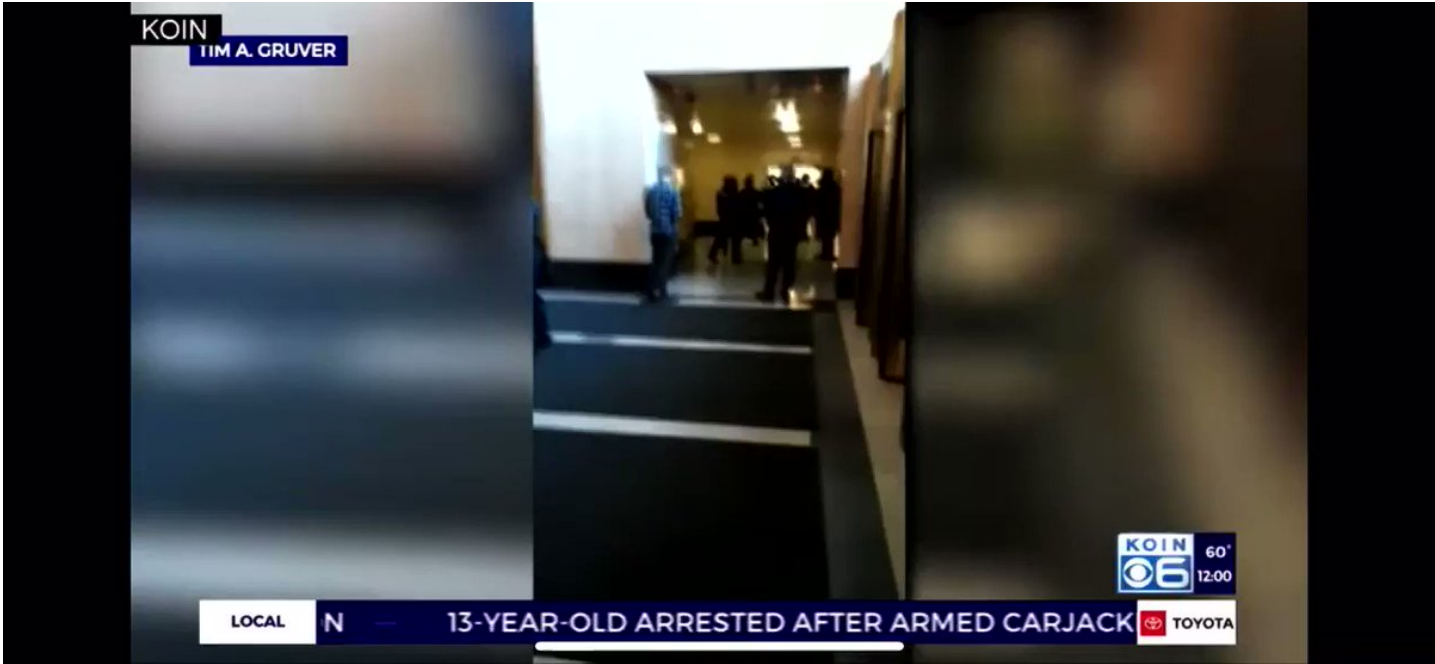
I didn't catch it on camera but here's immediately after I was stopped for violating curfew in Baltimore, during the Freddie Gray protests. Luckily I had credentials