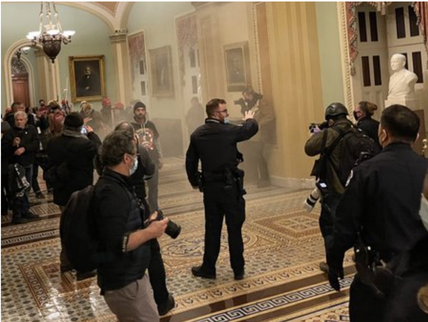
Here's what happened when I covered the George Floyd protests where four officers WERE ARRESTED AND CHARGED WITH MURDER