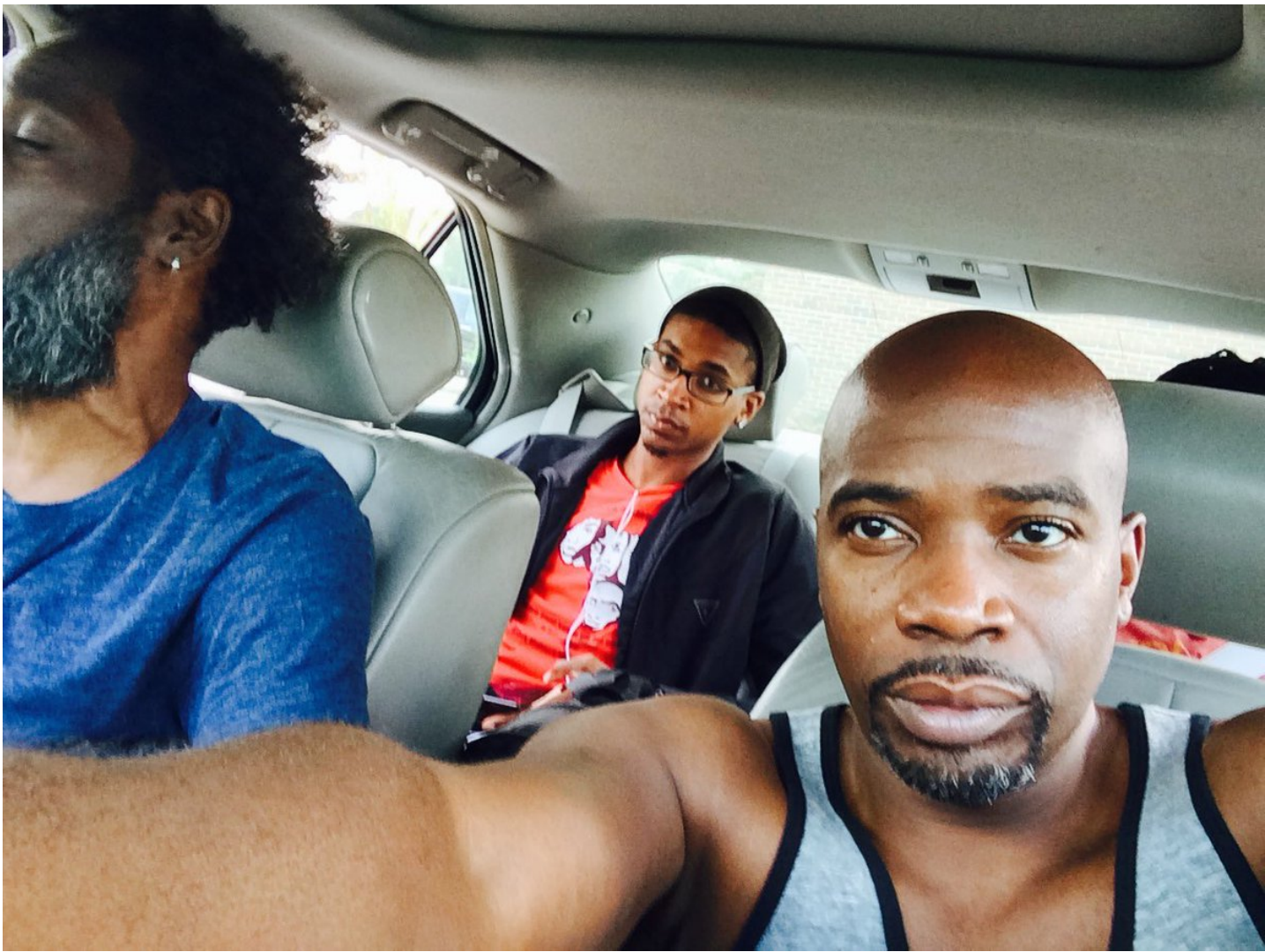
Oregon, 2 weeks ago