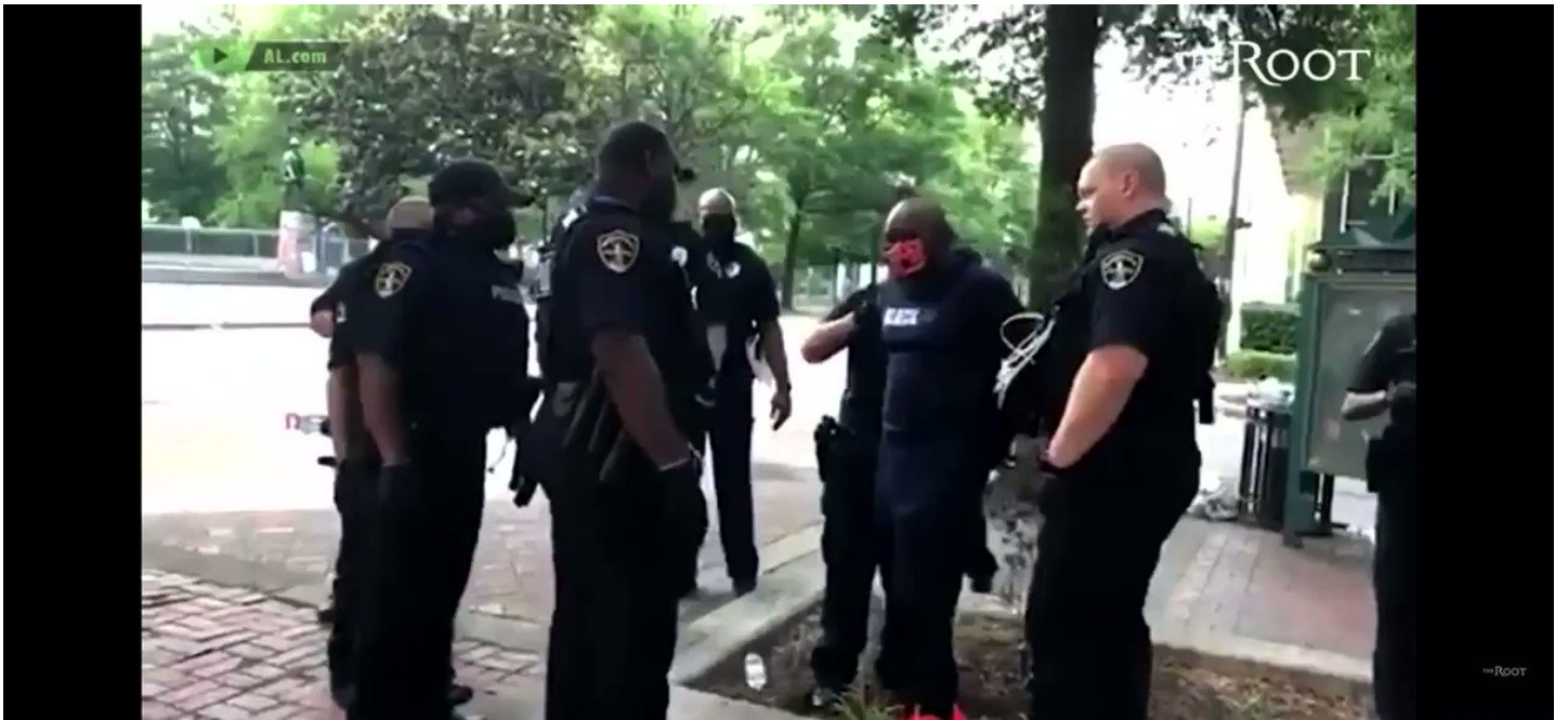
Here's what happened when they stormed the capital in Michigan