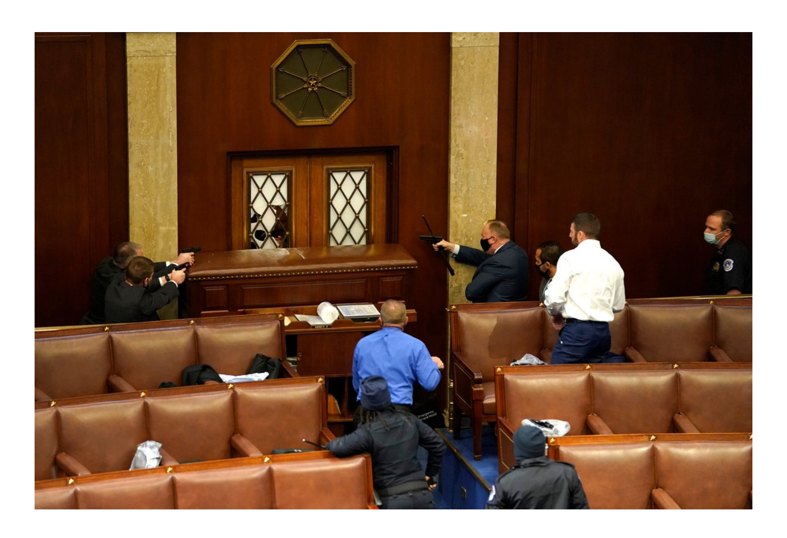
U.S. Capitol Police detain protesters outside of the House Chamber.