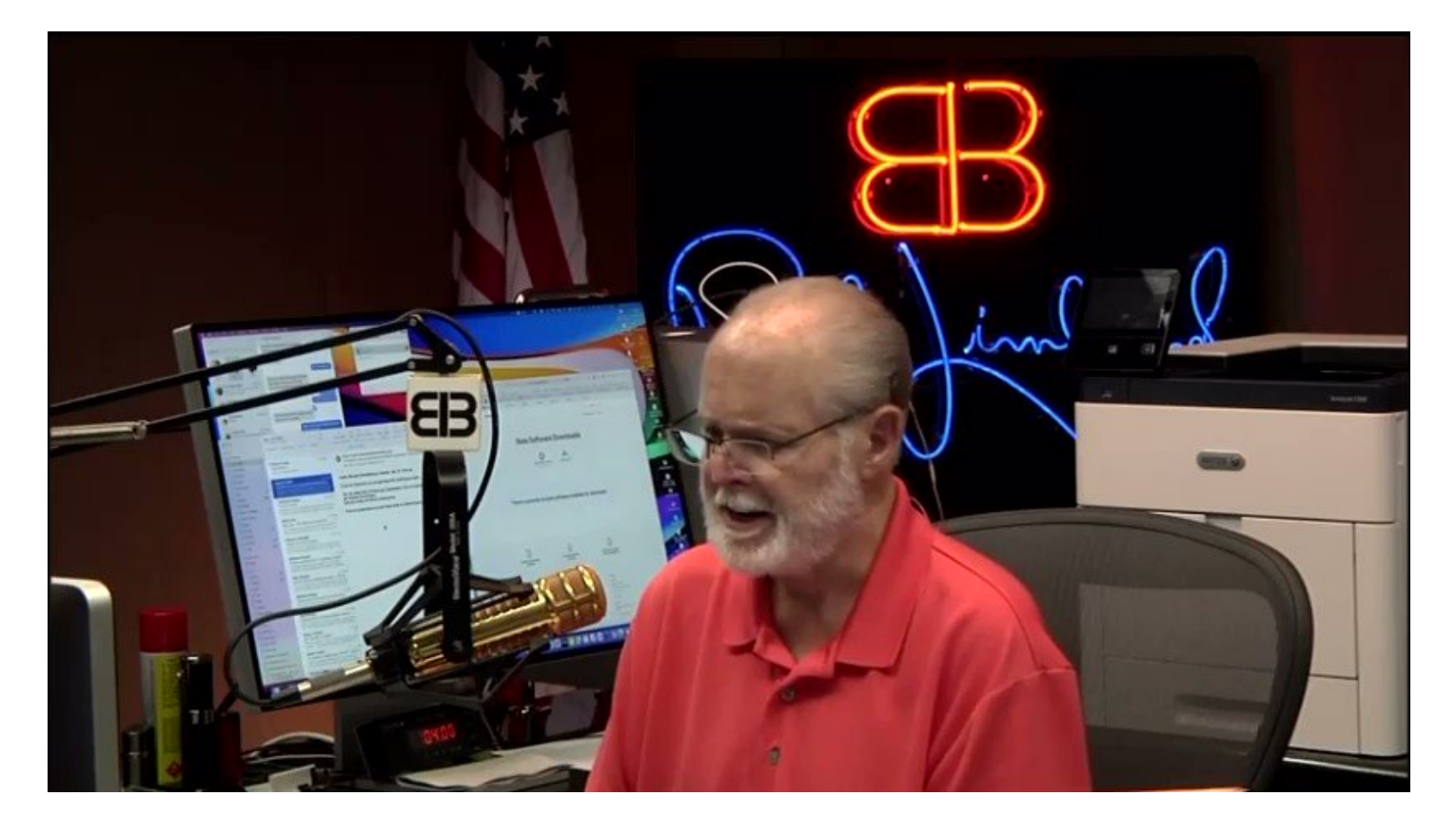
It is NOT unprecedented for the electoral count to be challenged, Dems did in 2916.