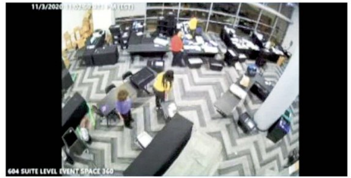
A woman in a yellow t-shirt is seen pulling a box that was beside a table at the State Farm Arena in Atlanta on Nov. 3, 2020.