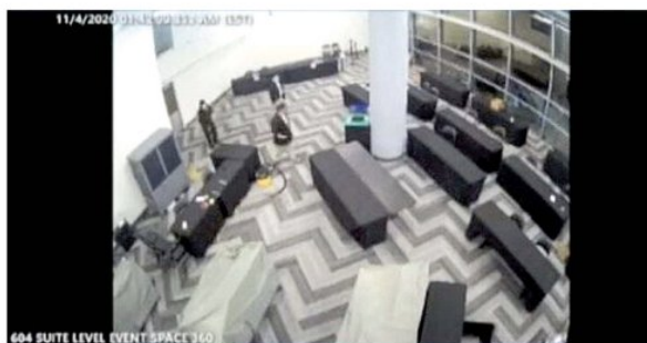
Three people, two of them likely the Republican poll monitors, are seen right after entering the tabulation center room at the State Farm Arena in Atlanta on Nov. 3, 2020.

Indeed, Alive 11 reported around 12:38 a.m. that "another official in Fulton County says some work is still being done at State Farm Arena with ballots."