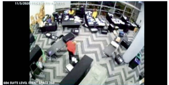
A man in a red shirt is seen pulling a box from underneath a table at the State Farm Arena in Atlanta on Nov. 3, 2020.