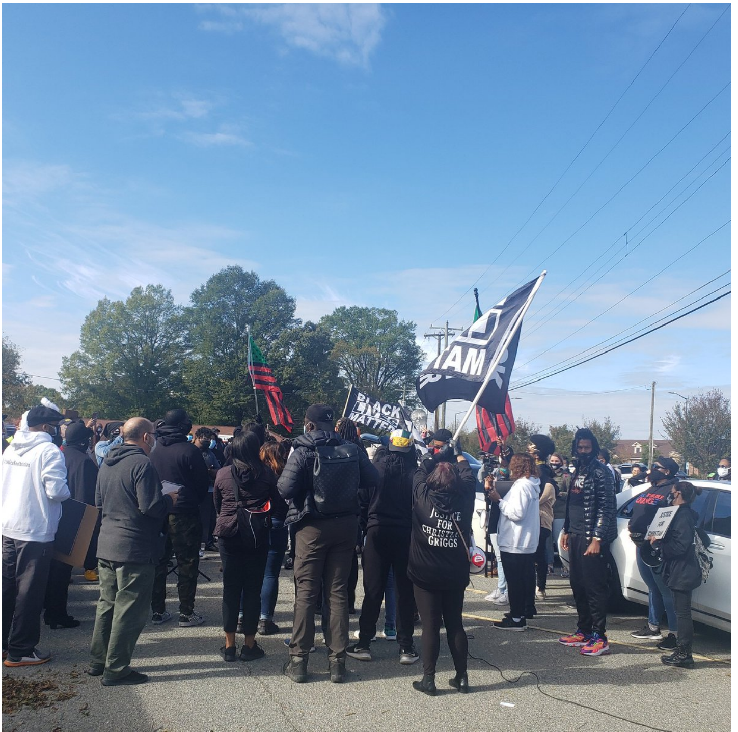
We then marched, escorted by police, about half a mile towards the center of Graham, chanting and singing. We moved slowly, because of the many elderly folks and families with small children. Graham is a small town in #AlamanceCounty.