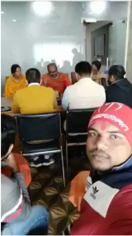
Here are a few facebook posts of Yati Narsinghanand shared by Shringi Yadav. But who's Mahant Yati Narsinghanand?