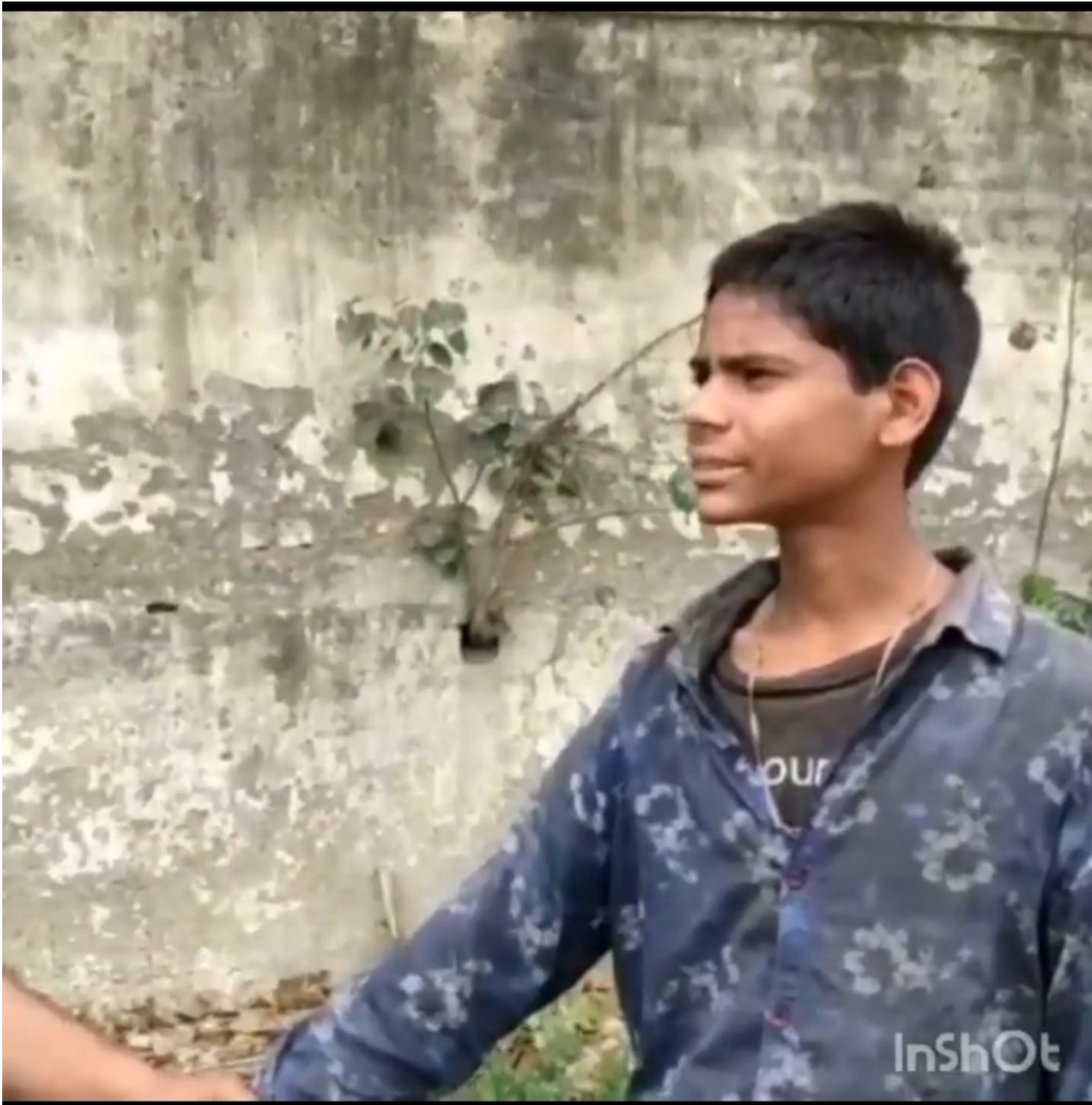
Here is a video of him with Yati Narsinghanand Saraswati.