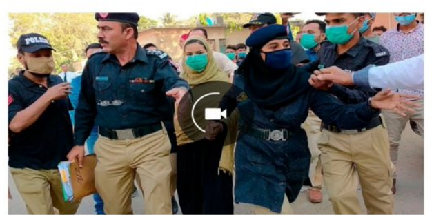
On Location: February 8, 2022Catch up on the developing stories making headlines.