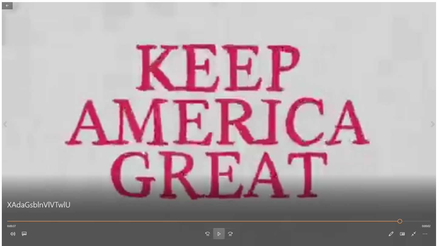
That also puts extra emphasis on the "36."