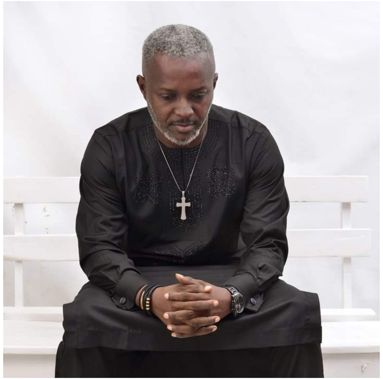
however agree that most of us make very conscious efforts monitoring almost every other thing in life, but our spiritual lives.

From the petrol in our car to that in our generators.