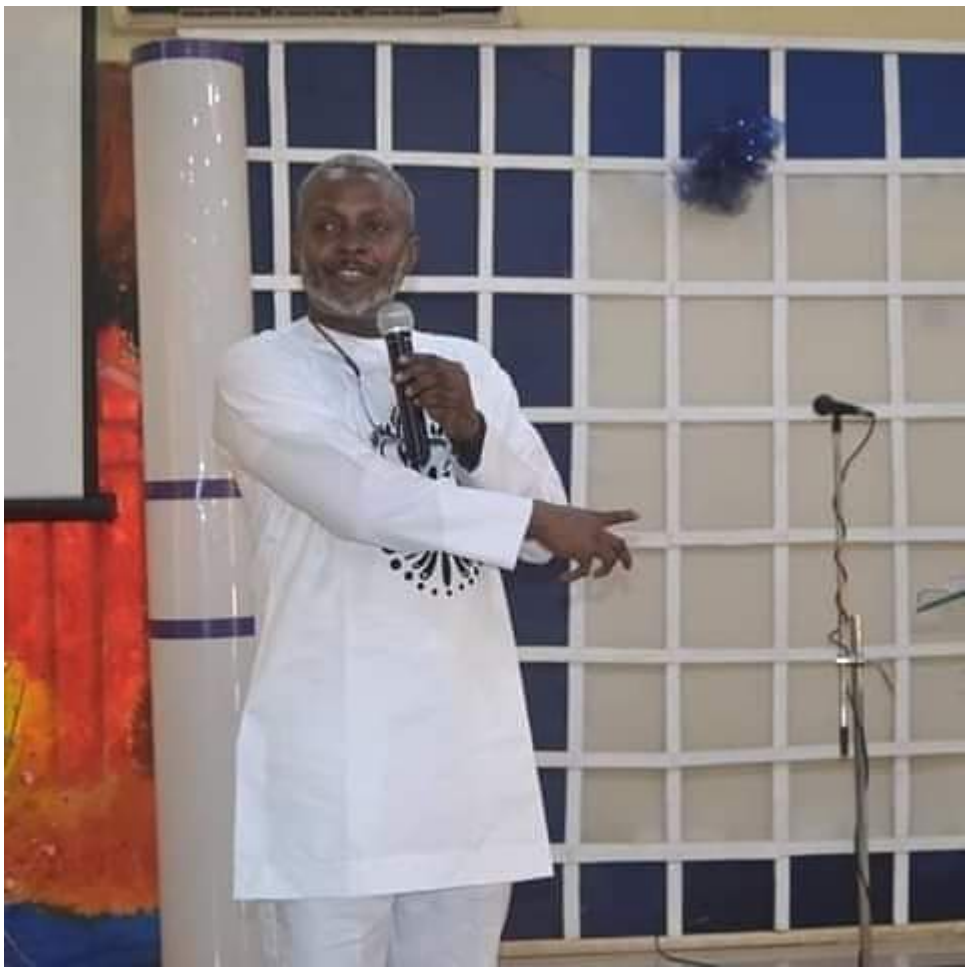
disarmed the powers and authorities, he made a public spectacle of them, triumphing over them by the cross.e (Col 2:15|NIV-)