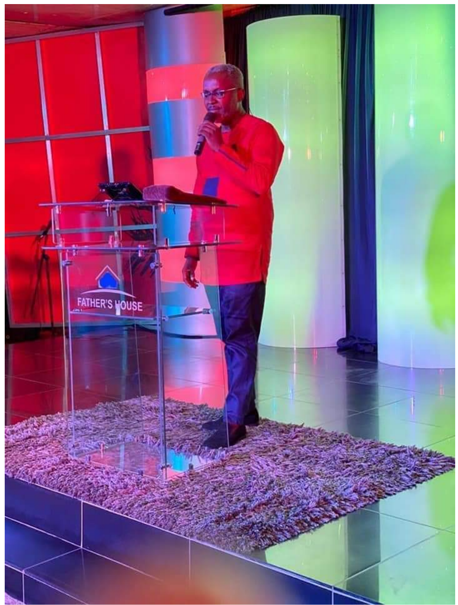
Some help you and it comes at a cost....they make you feel like a failure, a begger and even make you feel less of yourself.

The Bible therefore puts it this way in Psalm 60:11 KJV