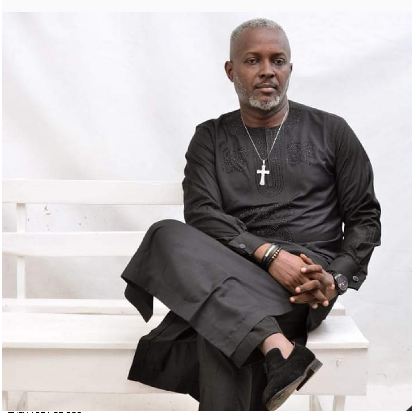
...THEY ARE NOT GOD.