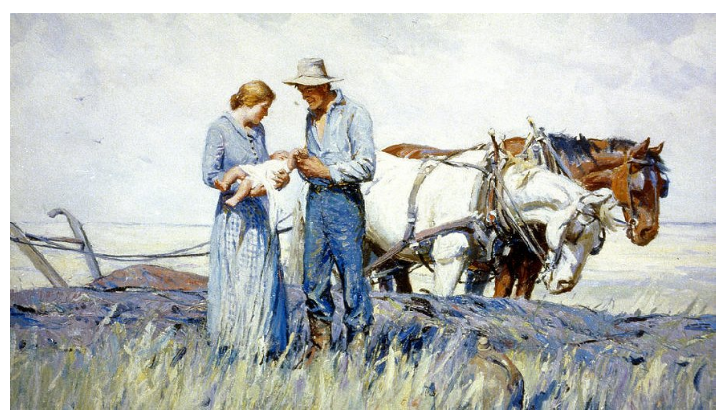
1. Self-Respect is paramount

Without self-respect, nothing else in life is possible. Discipline, integrity, work ethic, values: they're all made possible through self-respect. Guide your actions with the question "What would a self-respecting man do?" Then do that thing.